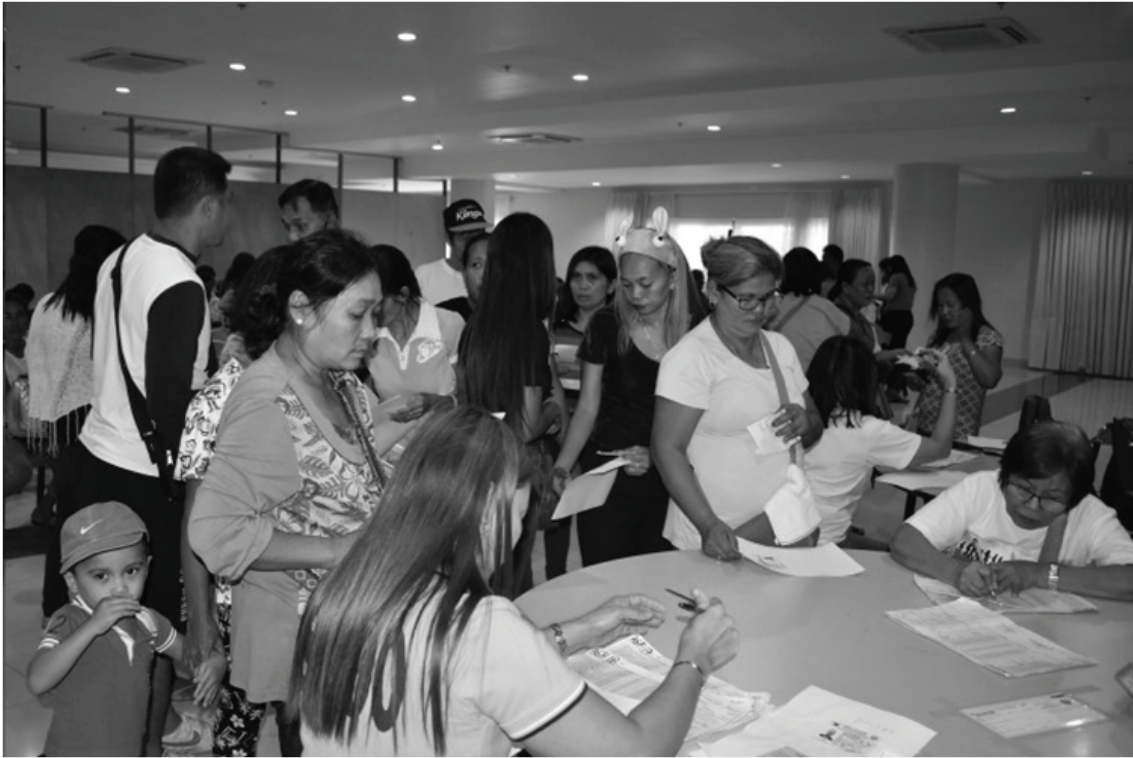
Hog raiser beneficiaries from the cities of Bacoor and Imus receive the financial assistance from the provincial government of Cavite.