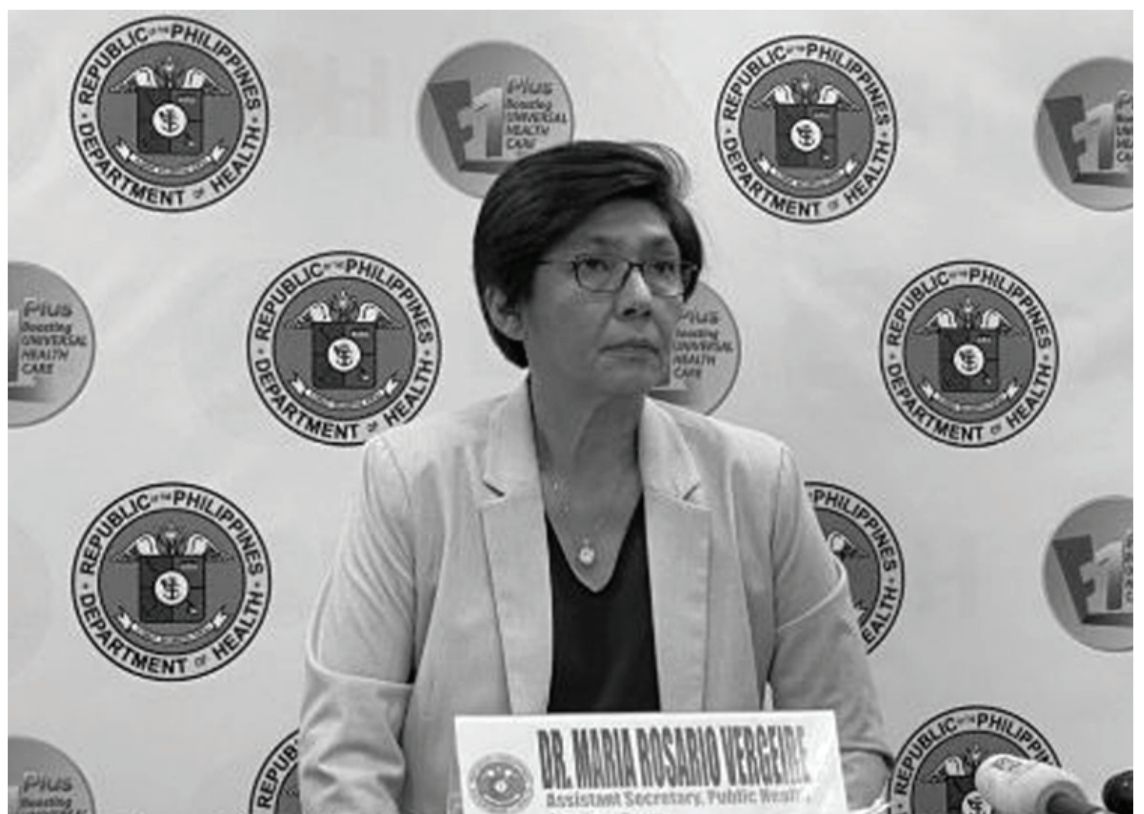
DOH Assistant Secretary, Dr. Maria Rosario Vergeire