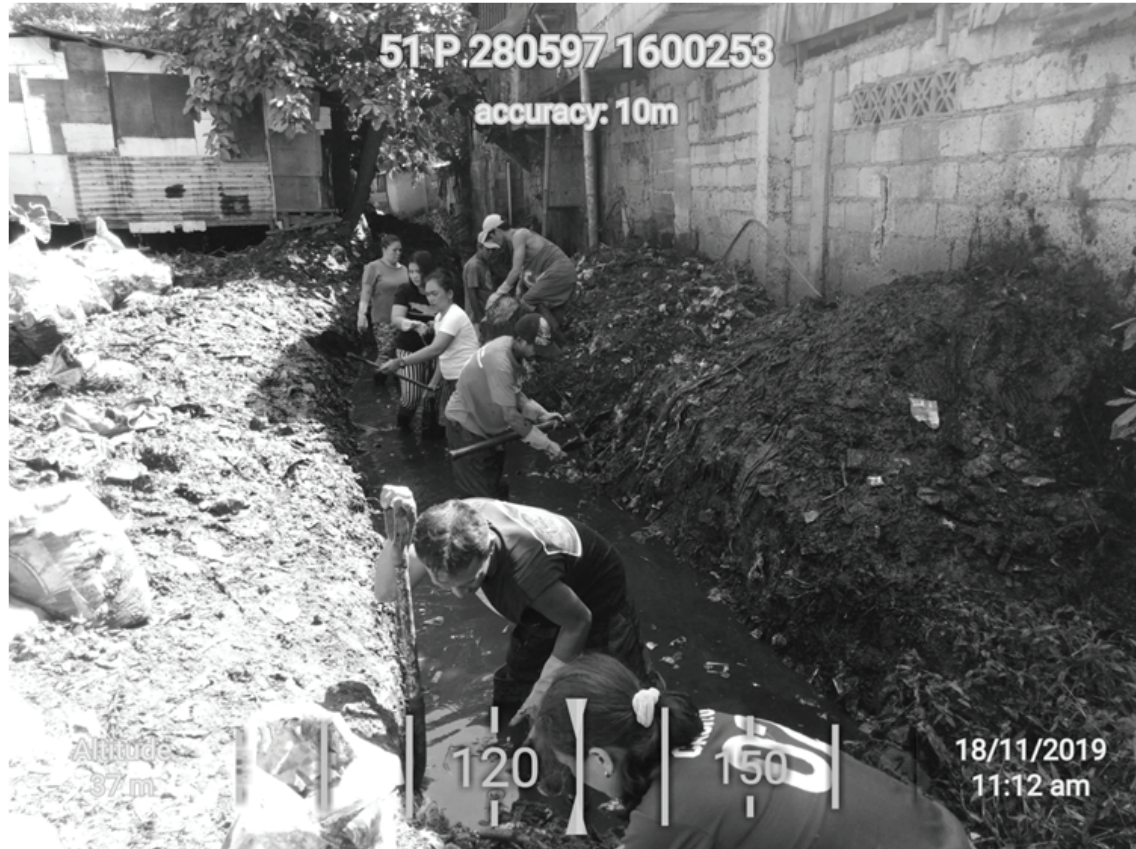
River marshals (Bantay Ilog) remove submerged garbage along the waterways in Brgys. Zapote II and Tabing Dagat in Bacoor City, Cavite as part of the massive clean-up in line with "Battle for Manila Bay" campaign.

Other activities included in the sub-project were: conduct of communication, education and public awareness campaigns on the Ecological Solid Waste Management Act; livelihood training on the conversion of solid waste into income-generating projects including composting and vertical gardening; fabrication and installation of informative signages; and monitoring of unlawful acts like disposal of wastes into waterways. (CZARINA MARIA P. GANDEZA, DENR Calabarzon/PIA-4A)