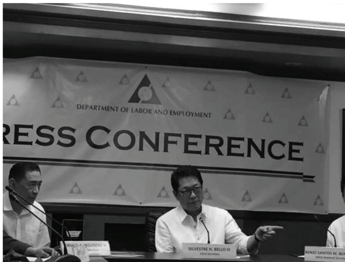
Labor Secretary Silvestre Bello III (FILE PHOTO)