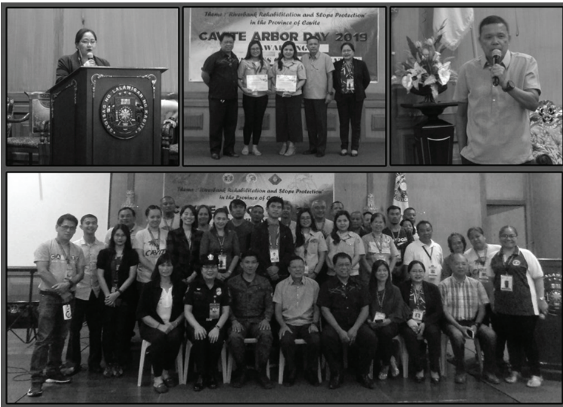
The Arbor Day 2019