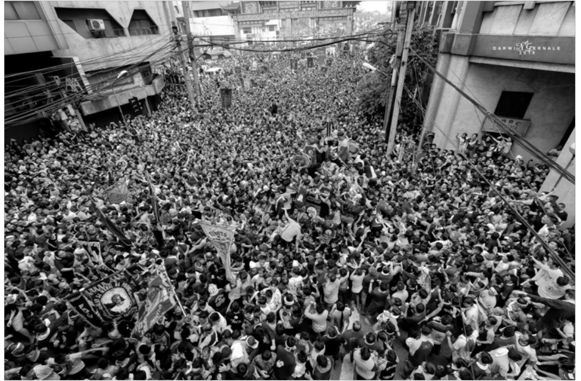
Black Nazarene devotees join the annual traslacion.