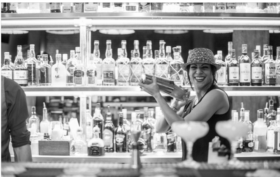
Rum & Sugar whipped up three Philippine rum cocktails using the Don: Sugarlandia Spritz with Aperol, Prosecco and soda water; Adam's Martial Arts; and Pasquale's Whipped Sweetness.

Ina Yulo is a freelance food and travel writer based in London. Follow her gastronomic adventures over at @forever_munching.