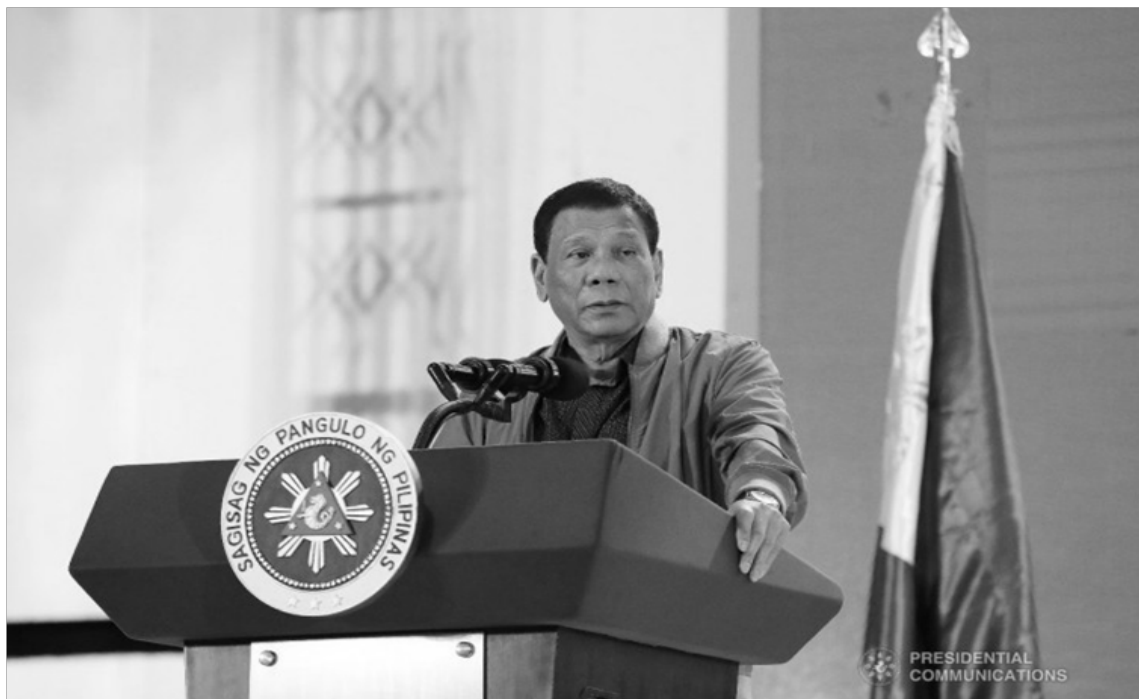
President Rodrigo Roa Duterte delivers his message during the birthday celebration of former Presidential Adviser on Political Affairs Atty. Francis Tolentino held at the Tagaytay International Convention Center in Tagaytay City, Cavite on January 3, 2019.

TAGAYTAY CITY, Cavite – Former political adviser Francis Tolentino’s 49th birthday celebration on January 3 was made extra special with the presence of the country’s chief executive, President Rodrigo Roa Duterte.