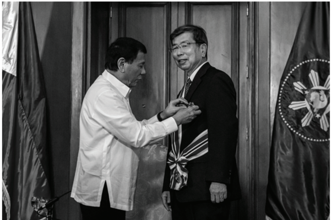
President of the Philippines Mr. Rodrigo Duterte awarded outgoing Asian Development Bank (ADB) President Mr. Takehiko Nakao the Order of Sikatuna, the Philippines' highest civilian recognition