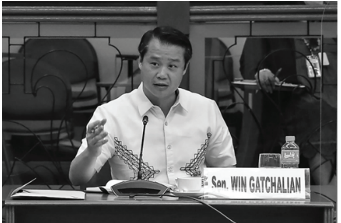
Sen. Win Gatchalian

• Switzerland • France • Germany • Iceland • Italy • Lebanon • Singapore