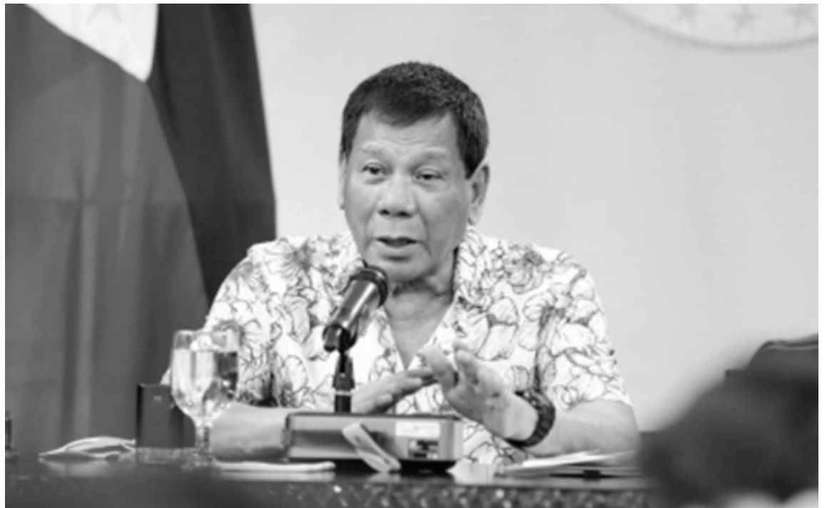
President Rodrigo Roa Duterte talks to the people after meeting members of the Inter-Agency Task Force on the Emerging Infectious Diseases at the Malago Clubhouse in Malacañang Park, Manila on Jan. 13, 2021. He said local government units have the say in choosing their brand of vaccine to administer to their constituents.