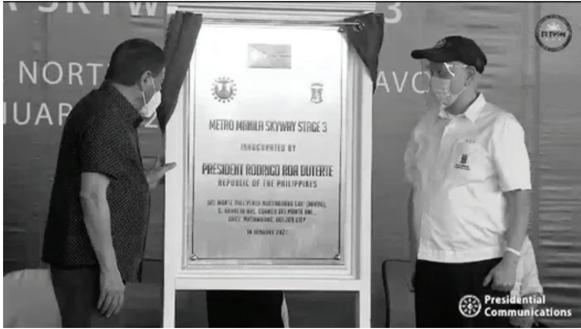
President Rodrigo Roa Duterte is joined by San Miguel Corp. chief Ramon Ang.

"For many years, our people have greatly suffered from the perennial problem of road congestion in the National Capital Region. Come to think of it actually when all of the skyways will be completed, I think 'yung pagtitiis ng mga tao (people's suffering) will be cut by about one-third, not really lahat (all) but it will cut the inconvenience and it will make you comfortable," Duterte said. (PIA NCR)