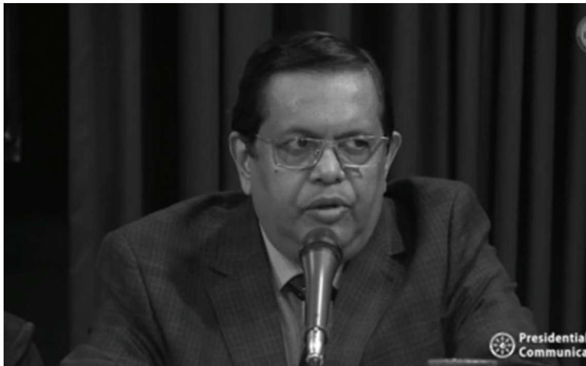
WHO Country Representative Rabindra Abeyasinghe