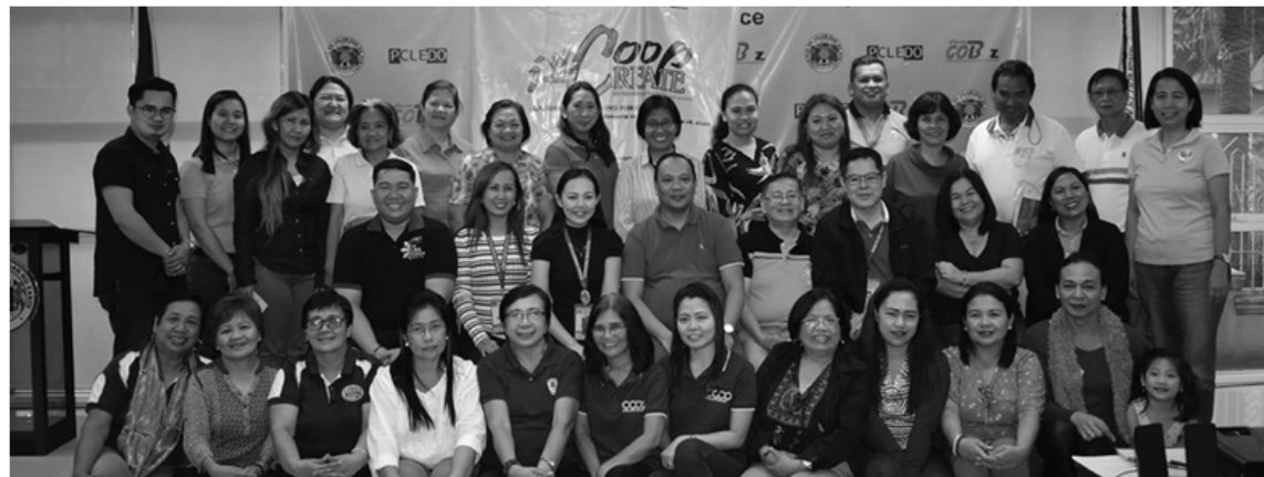
Cavite Cooperative Development Center in Trece Martires City

President Duterte also assured that every single centavo will be given directly to the beneficiaries. (GG/PIA4A)