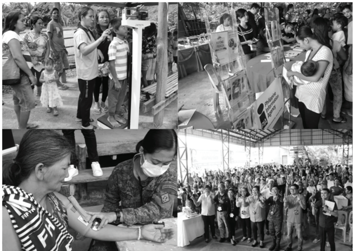
Aside from medical and dental assistance, and distribution of food packs, additional services were also offered such as job fair, free haircut and massage, provision of seedlings, civil registration, and TESDA scholarship.

"Sustain your gains last year and foster ELCAC efforts so that the RTF-ELCAC 4A will be the first to end the insurgency in the country."