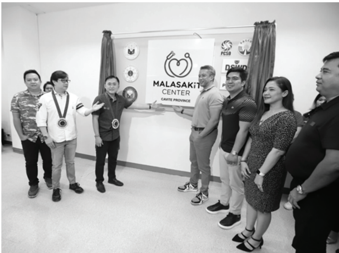
Senator Christopher Lawrence "Bong" Go joined the launching of the 59th Malasakit Center

CAVITE--Senator Christopher Lawrence "Bong" Go joined the launching of the 59th Malasakit Center in the country on Wednesday, January 22 at the General Emilio Aguinaldo Memorial Hospital in Trece Martires City in Cavite, one of the areas affected by the recent eruption of Taal Volcano.