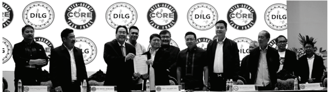
Interior and Local Government Secretary Eduardo Año turns over to Cagayan de Oro Rep. Rufus Rodriguez, House committee on constitutional amendments chairman, a resolution of the Constitutional Reform or CORE Movement calling for Charter change during the group's launching yesterday in Quezon City.

Rodriguez' committee had already voted to put the provisions opening the country's economy to