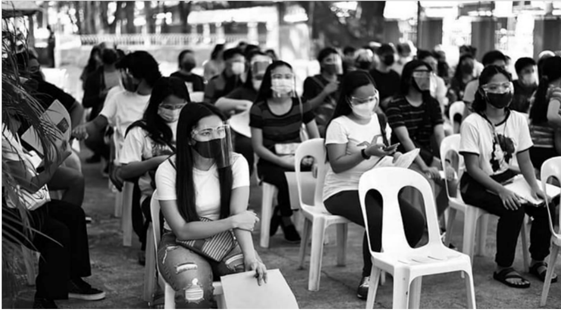
900 Estudyante sa Kolehiyo ng Gentri, tumanggap ng Educational Assistance

Sinimulan ng Pamahalaang Lungsod ng General Trias ang pamamahagi ng educational assistance sa Gentriseño scholars na nag-aaral sa kolehiyo. Nasa 900 mga mag-aaral ng Cavite State University - General Trias Campus ang nakatanggap ng tulong pinansyal para sa 2nd Semester ng School Year 2020-2021.