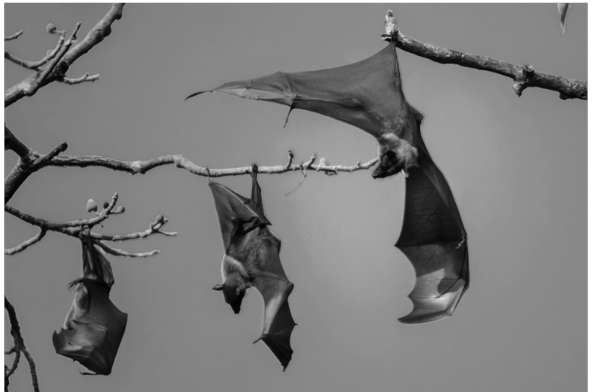
Burmese fruit bats