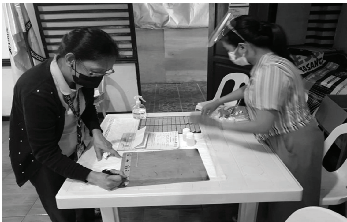
DOH-CALABARZON personnel participates in the random drug testing activity conducted at the regional office inside the QMMC compound from June 9-10 and June 15-17, 2021.