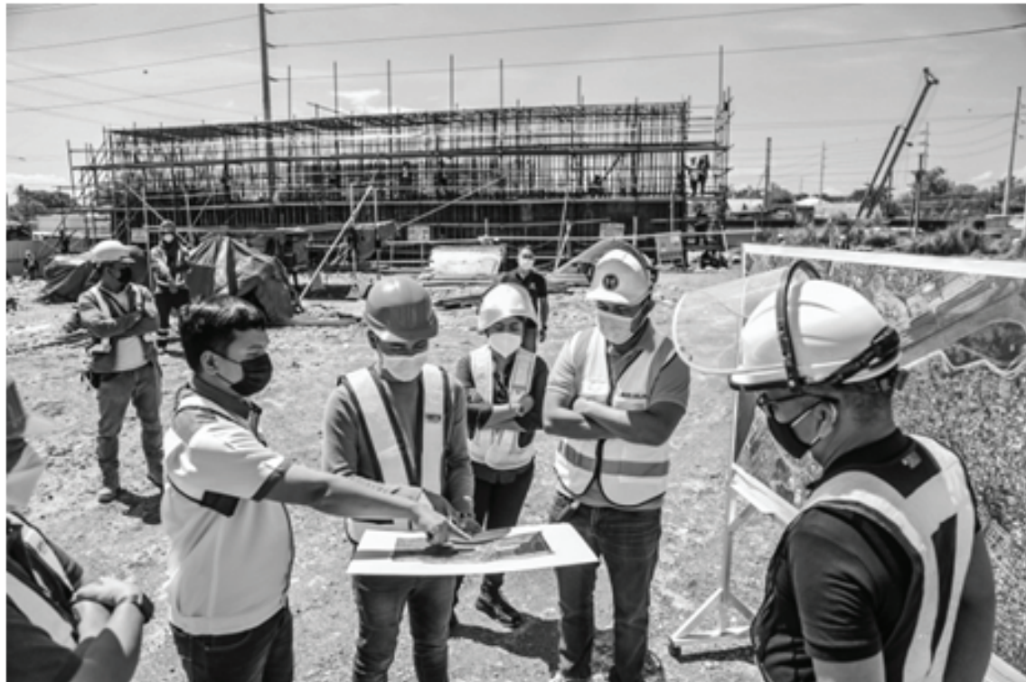
The CIC is a subsidiary of the Metro Pacific Tollways Corporation (MPTC). Aside from the CAVITEX and CALAX, MPTC's portfolio includes the concessions for the North Luzon Expressway (NLEX), the Subic-Clark Tarlac Expressway (SCTEX), the NLEX Connector Road, and the Cebu-Cordova Link Expressway (CCLEX) in Cebu.