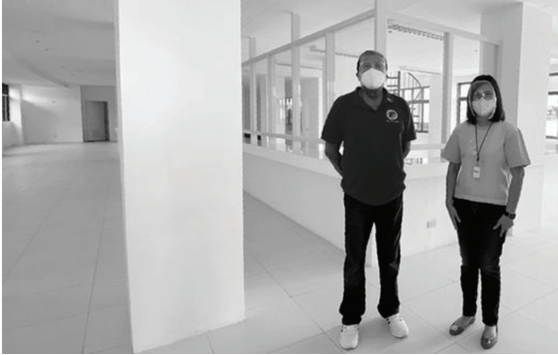
DoTr Secretary Art Tugade together with Bacoor City Mayor Lani M. Revilla inspects the ongoing construction of the Bacoor City LTO District Office during his visit to the city. He also met with the members of the transport groups in the city to share with them the DoTr's programs that will help them with livelihood.