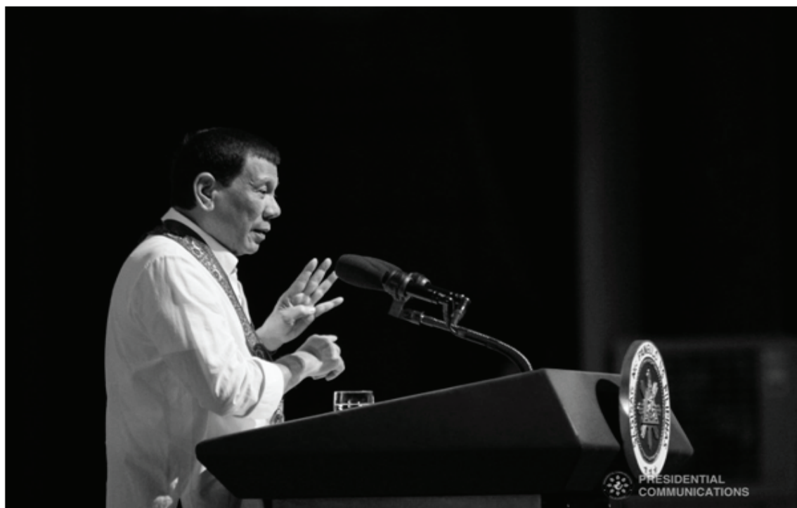
President Rodrigo Roa Duterte delivers his speech during the 28th Bureau of Jail Management and Penology anniversary at Camp General Emilio Aguinaldo in Quezon City on July 12, 2019.