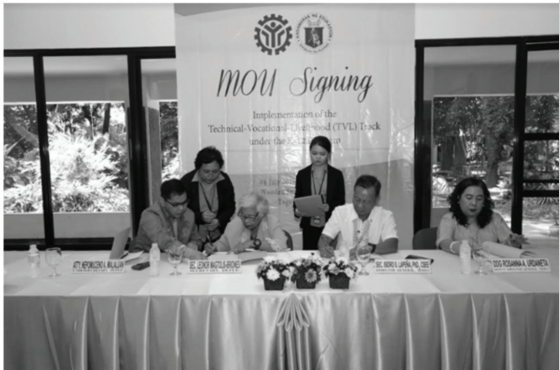
The Department of Education (DepEd) and Technical Education and Skills Development Authority (TESDA) on Tuesday signed a Memorandum of Understanding (MOU) establishing a Joint Working Group (JWG) to harmonize technical-vocational-livelihood (TVL) education and skills training in the Philippine basic education system.