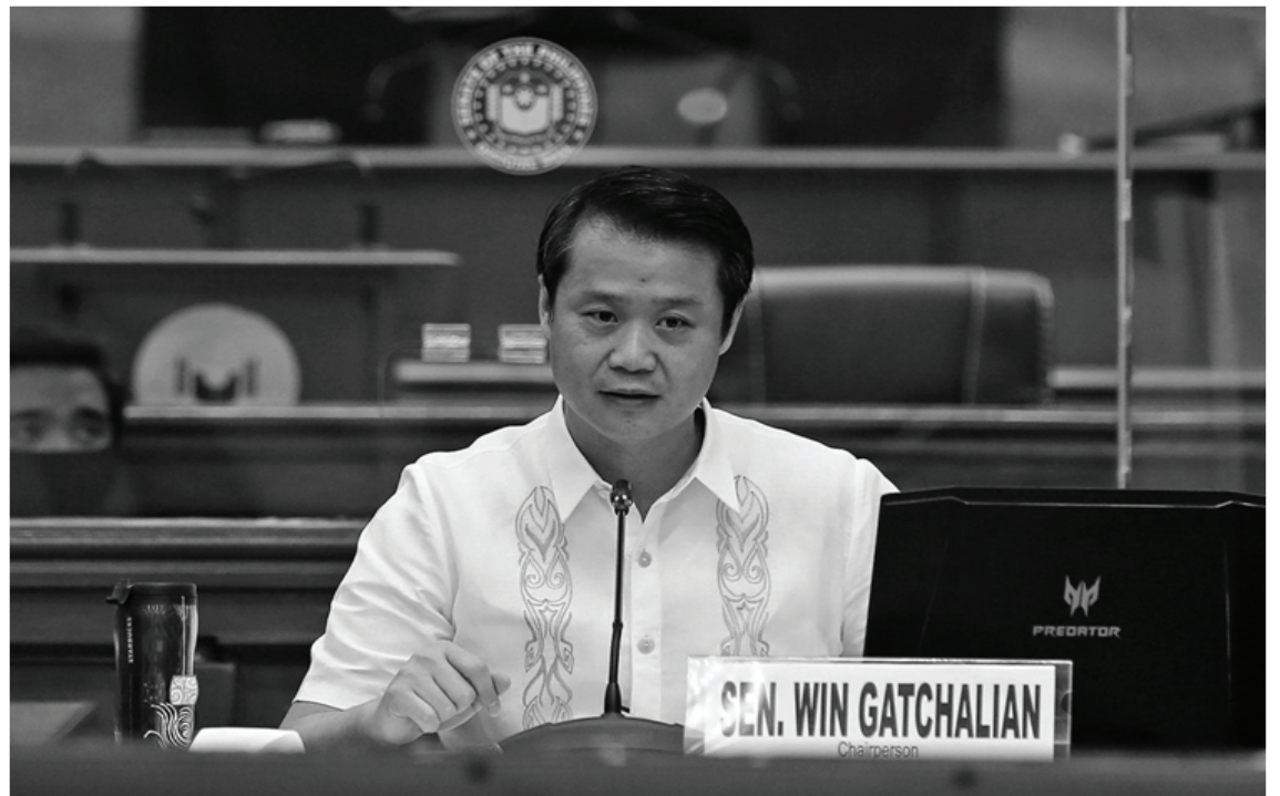
SEN WIN GATCHALIAN