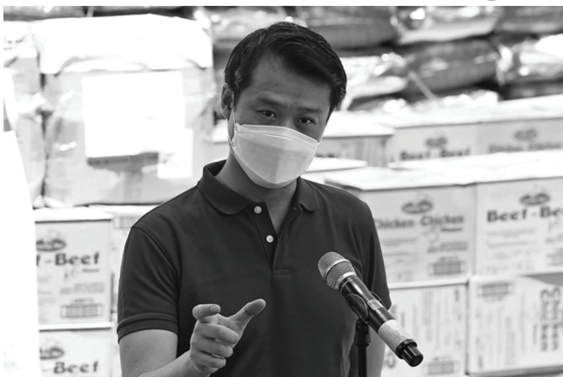
Si Senator Sherwin "Win" Gatchalian habang nasa isang press conference sa labas ng Metro Manila kamakailan.