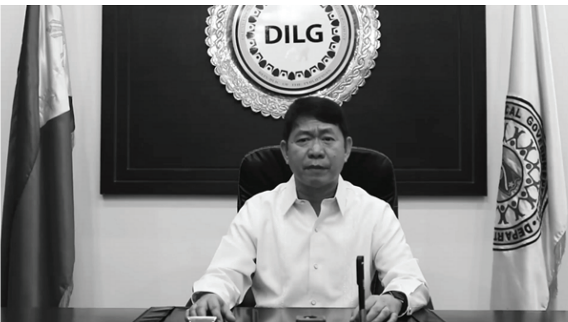
Department of the Interior and Local Government (DILG) Secretary Eduardo M. Año