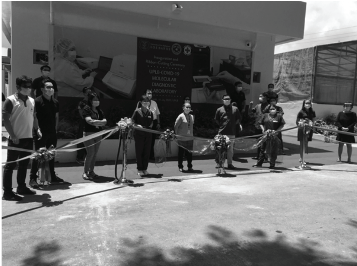
The proficient and highly capable personnel of the UPLB CMDL.

The facility will officially start accepting testing clinical specimens of COVID-19 on July 13, 2020.