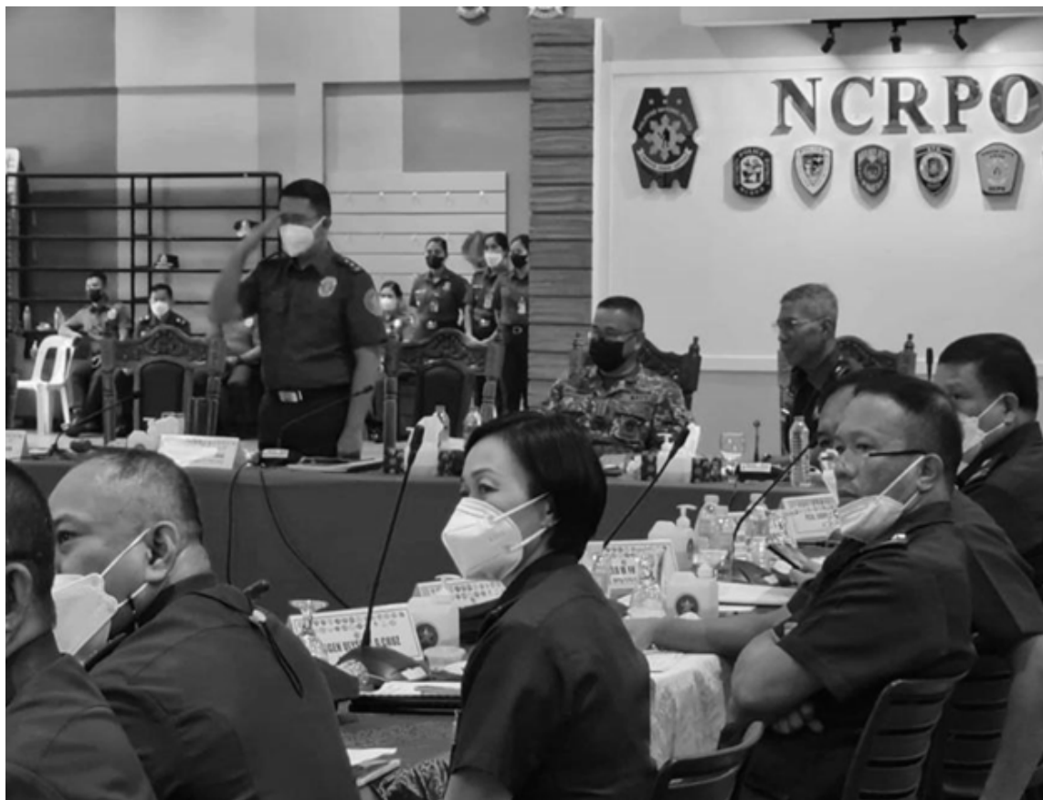
"Bongbong" Marcos Jr.'s first State of the Nation Address on Monday, July 25.