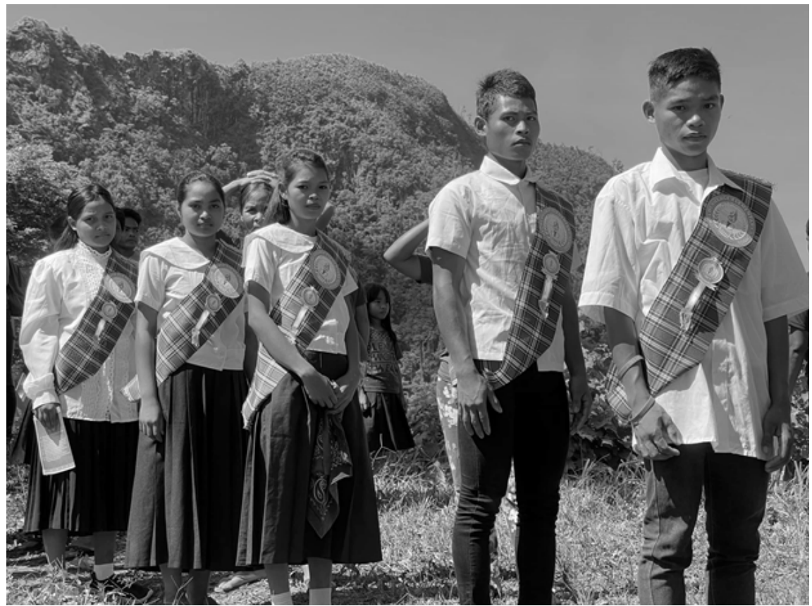
Ang limang katutubong mag-aaral ng Kelwi Village Elementary School na nagtapos ng Grade 6. Ang Kelwi Village ES ay isang IP School sa Bayan ng Brooke’s Point. Ito ang kauna-unahang graduation ceremony ng nasabing paaralan na ginanap noong Hunyo 27, 2022.