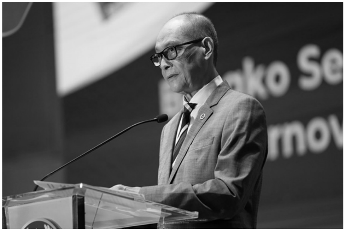
Finance Secretary Benjamin Diokno