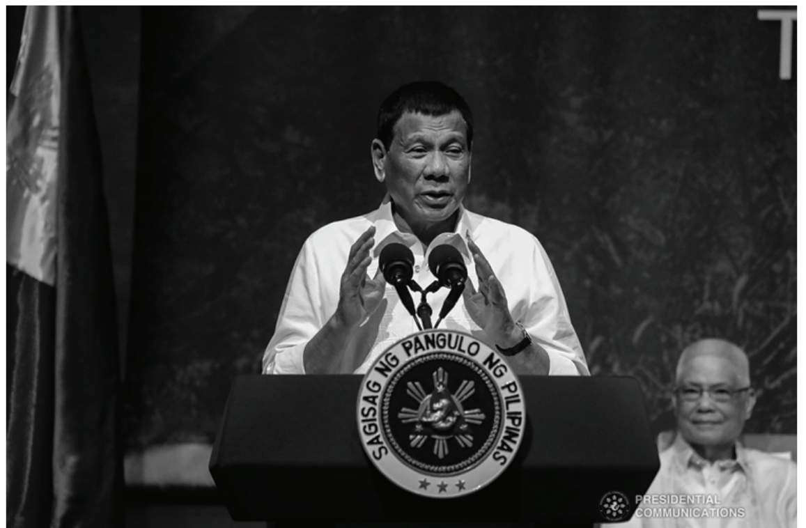
President Rodrigo Roa Duterte delivers his speech during the meeting with the Filipino community at the Palace Hotel in Tokyo, Japan on May 30, 2019.