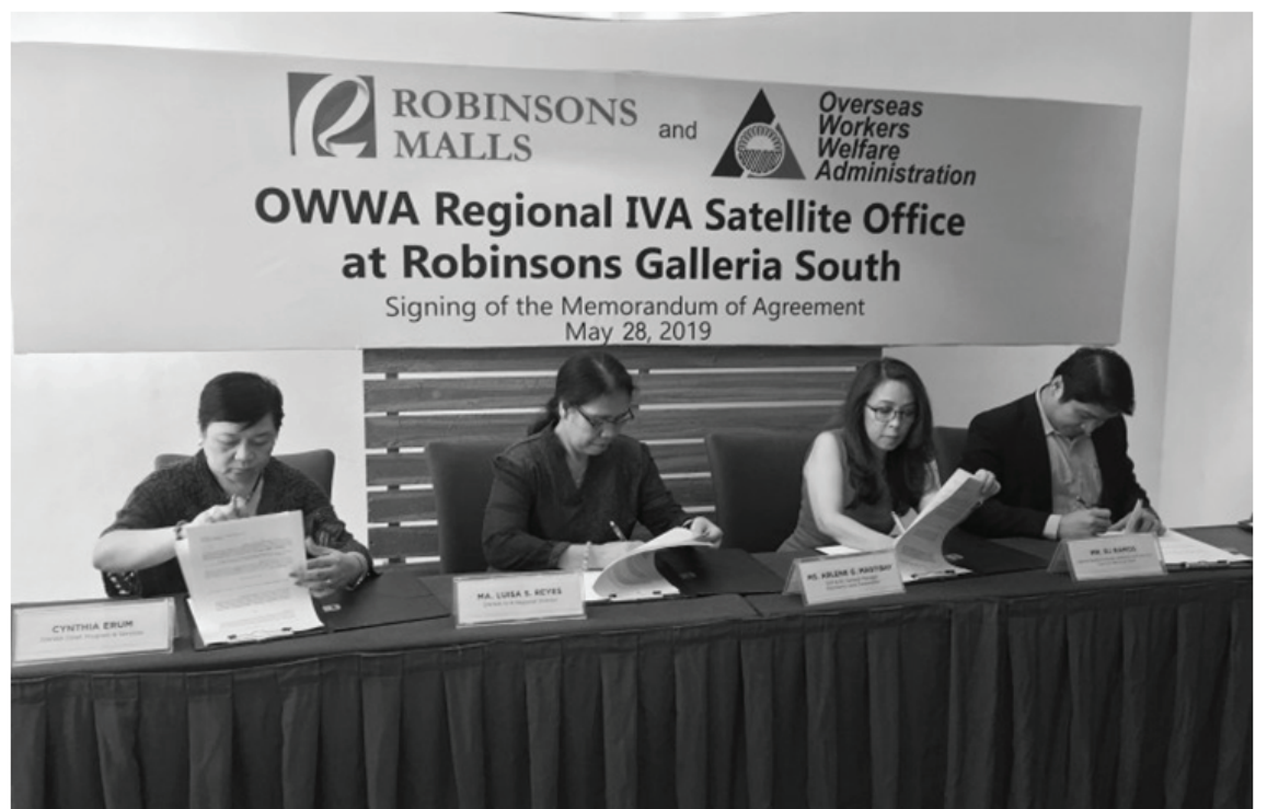
The Overseas Workers Welfare Administration IV-A and Robinsons Land Corporation ink a Memorandum of Agreement for the establishment of an OWWA Satellite Office at the Robinsons Galleria South which is targeted to open July 2019. (GG, PL44A)

The National Economic continue to page 2