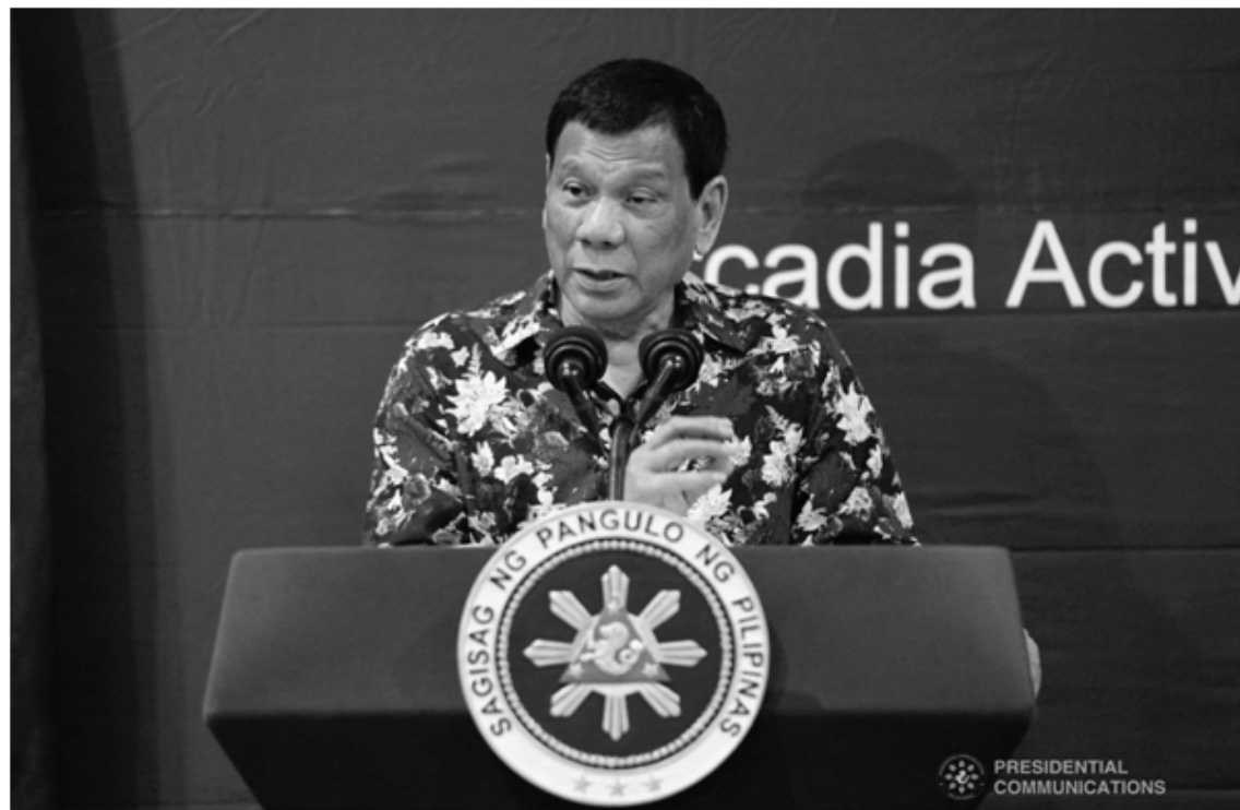
President Rodrigo Roa Duterte delivers his speech during the 2019 Eid'l Fitr Celebration at the Arcadia Active Lifestyle Center in Davao City on June 6, 2019.