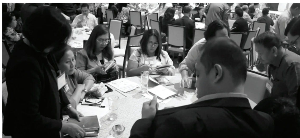
Scene from the CES Public Leaders' Summit