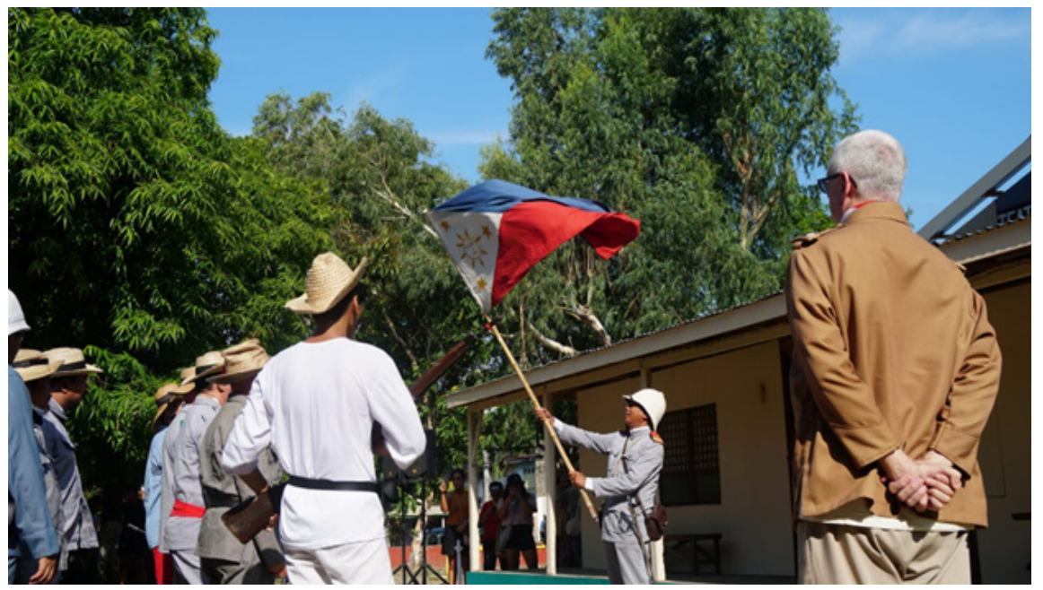
REENACTMENT of the unveiling of the first Philippine flag.