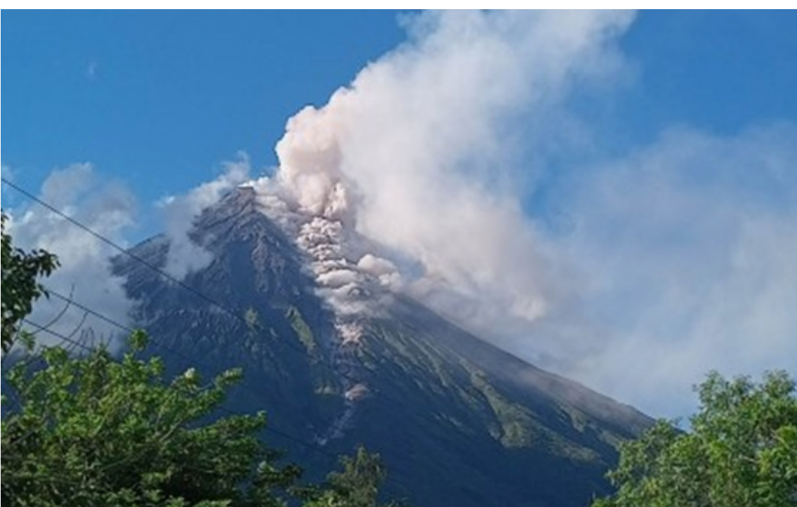
ALERT LEVEL 3. Mayon Volcano as taken from Barangay Anoling, Camalig town in Albay province on Thursday (June 8, 2023) The Albay Provincial Disaster Risk Reduction and Management Council ordered the evacuation of residents in areas surrounding the Mayon Volcano in order to avoid danger to lives and property posed by its increased activity.

Bacolcol said the 2018 continue to page 2