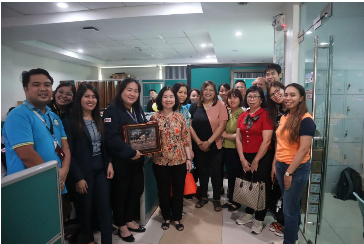
TYM visits the CMIT office to meet the IT providers behind the CARD MRI digitalization.

Following the exposure visit in the Philippines, TYM intends to review their APP, TYM Mobile, and make adjustments to fit clients' needs and conditions as a way to implement digitalization in Vietnam.