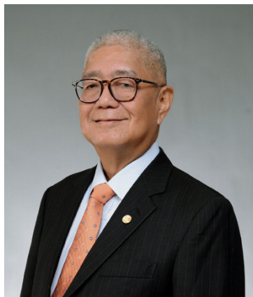
New Bangko Sentral ng Pilipinas Governor Eli Remolona