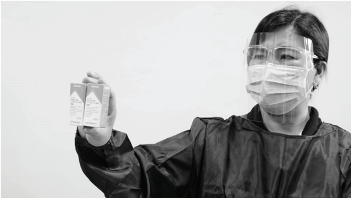
Nagsimula na rin ang malawakang pagbabakuna kontra COVID-19 sa 114 healthcare workers ng Southern Tagalog Regional Hospital sa lungsod ng Bacoor, Cavite nitong Miyerkules, Marso 10.