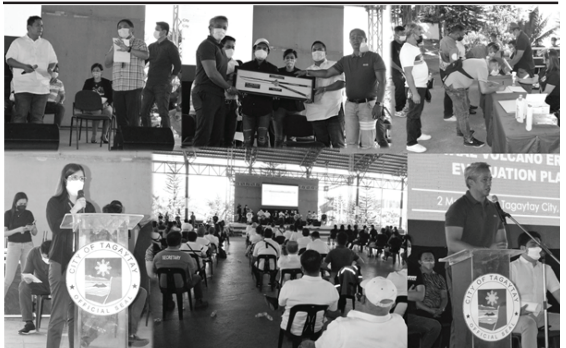
Cavite Evacuation Plan for Taal volcano eruption bared (Contributed photo)

The Department vowed to continue to uphold the interest and welfare of senior citizens and PWDs especially amid the ongoing health crisis. (DSWD)