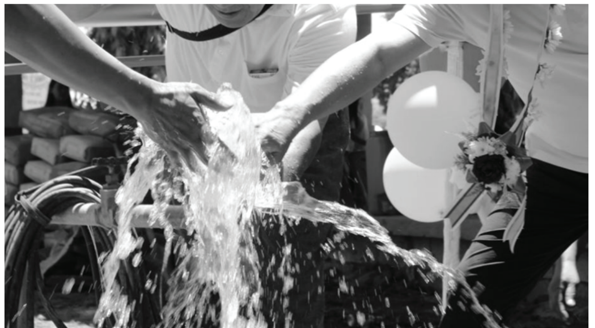
Water project benefiting a local community