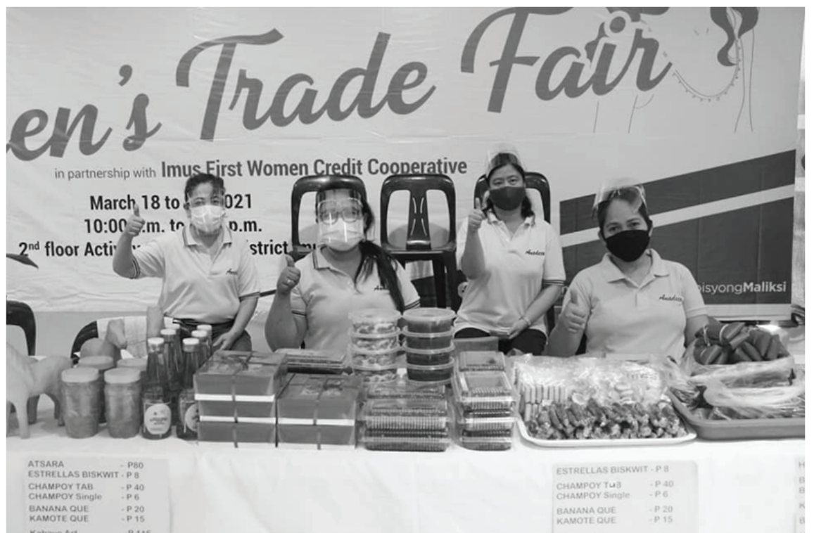
The Women's Trade Fair is one of the City of Imus' various activities slated for Women's Month.

Samantala, magbabalik operasyon naman ang MRT-3 sa publiko sa Lunes, Abril 5, 2021. (PIA NCR)