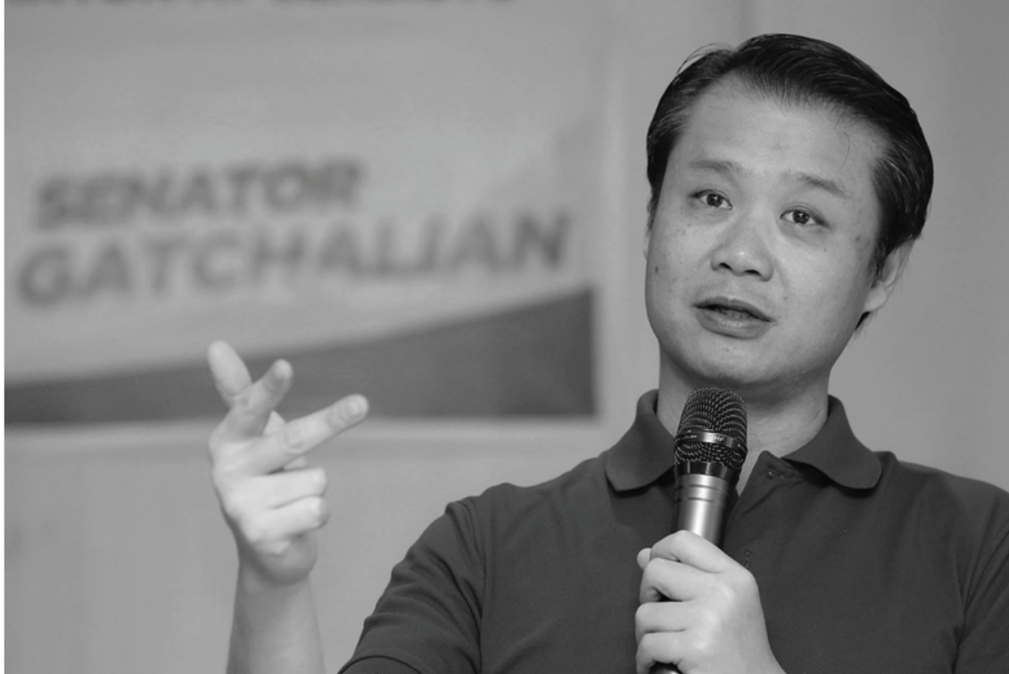
Senator Win Gatchalian