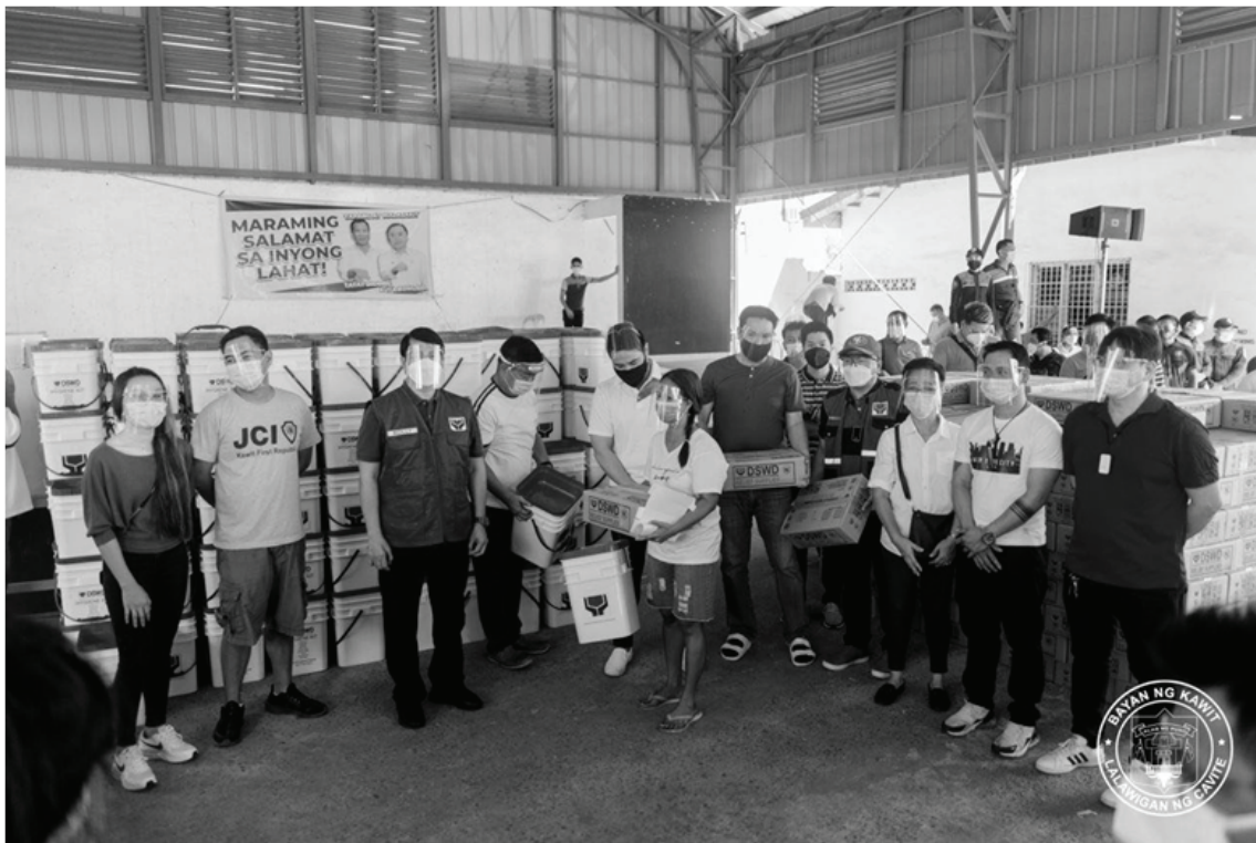
The Kawit LGU and other government executives helped victims of the recent fire in Barangay Samala-Marquez.