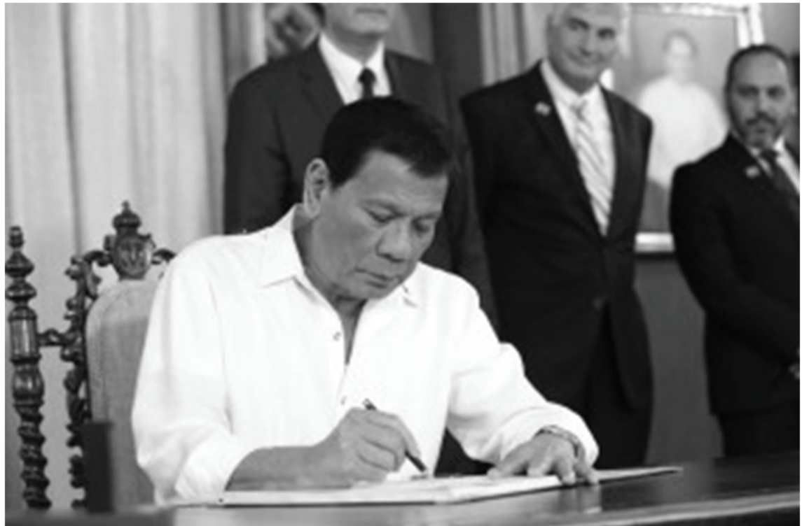
President Rodrigo Roa Duterte