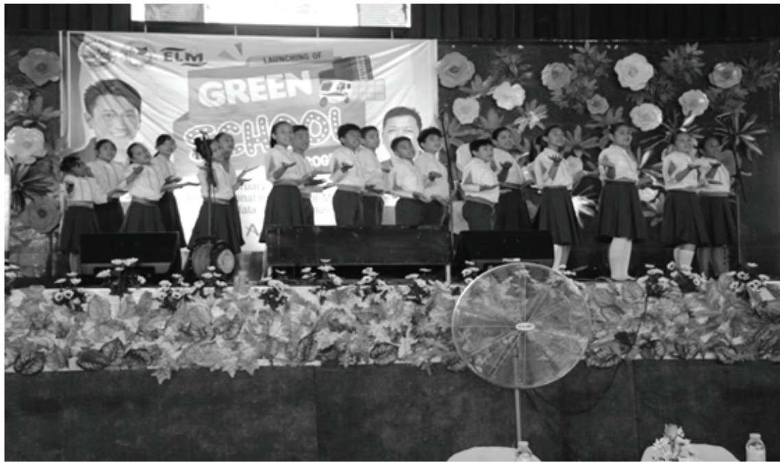
Students from Imus National High School-Main campus hops and sings as the the city government launches the first Green School Program which will help in the promotion of environmental awareness and care for Mother Nature.