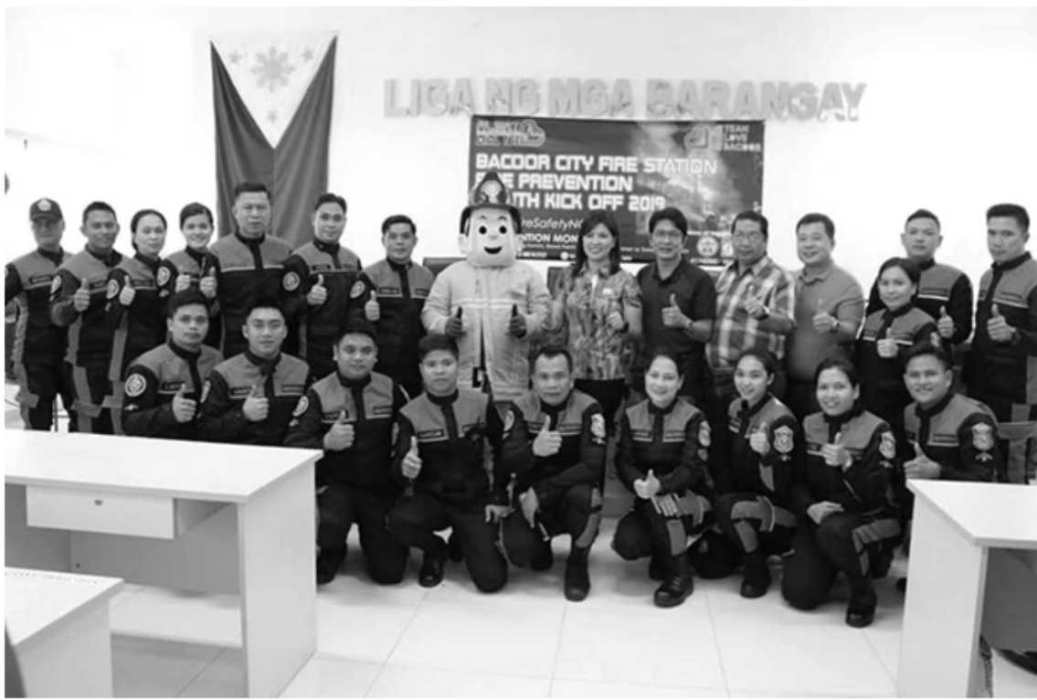
Fire Prevention Month: Bacoor City Mayor Lani Mercado Revilla (in blue shirt) joins the Bureau of Fire Protection (Bacoor City Fire Station) officials during the city's fire prevention activities. A Memorandum of Agreement was signed between the Bureau of Fire Protection-Bacoor City Fire Station and the Liga ng mga Barangay. Said agreement which is under the Oplan Ligtas na Pamayanan, will involve a program to increase the number of trained and organized communities to serve as partners in fire protection efforts, decreasing the occurrence of fires in the most vulnerable parts of communities, and encouraging communities to develop a Community Fire Protection Plan.

BACOOR CITY, CAVITE -- The month of March is the Fire Prevention month in the Philippines when the heat of summer fuels up more incidents of fire in and out of the congested metropolis.