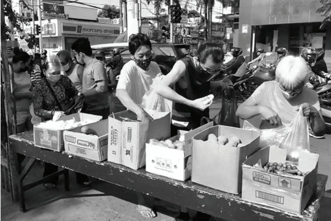
PIA NCR file