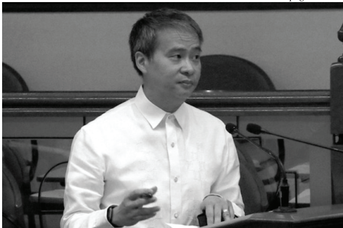
Sen. Joel Villanueva