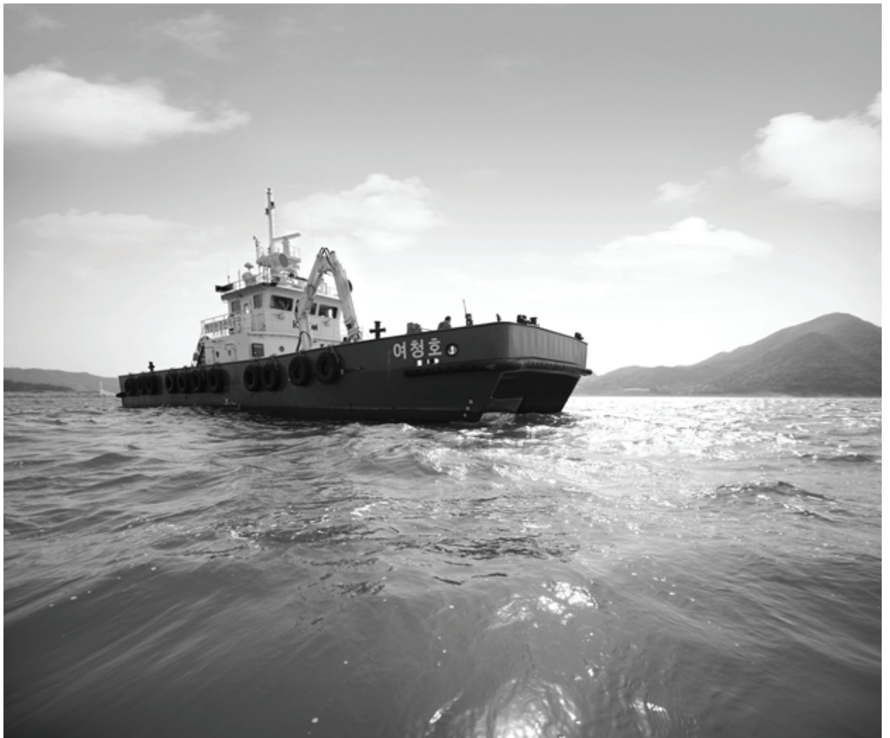
A clean-up vessel, which will be donated by the Korean government under the KOICA project, is projected to arrive in the Philippines late next year.

"We hope more businesses through the help of the Embassy of the Republic of Korea will be our partners in our endeavor of integrating biodiversity considerations into plans and business models", she said. (PIA NCR)