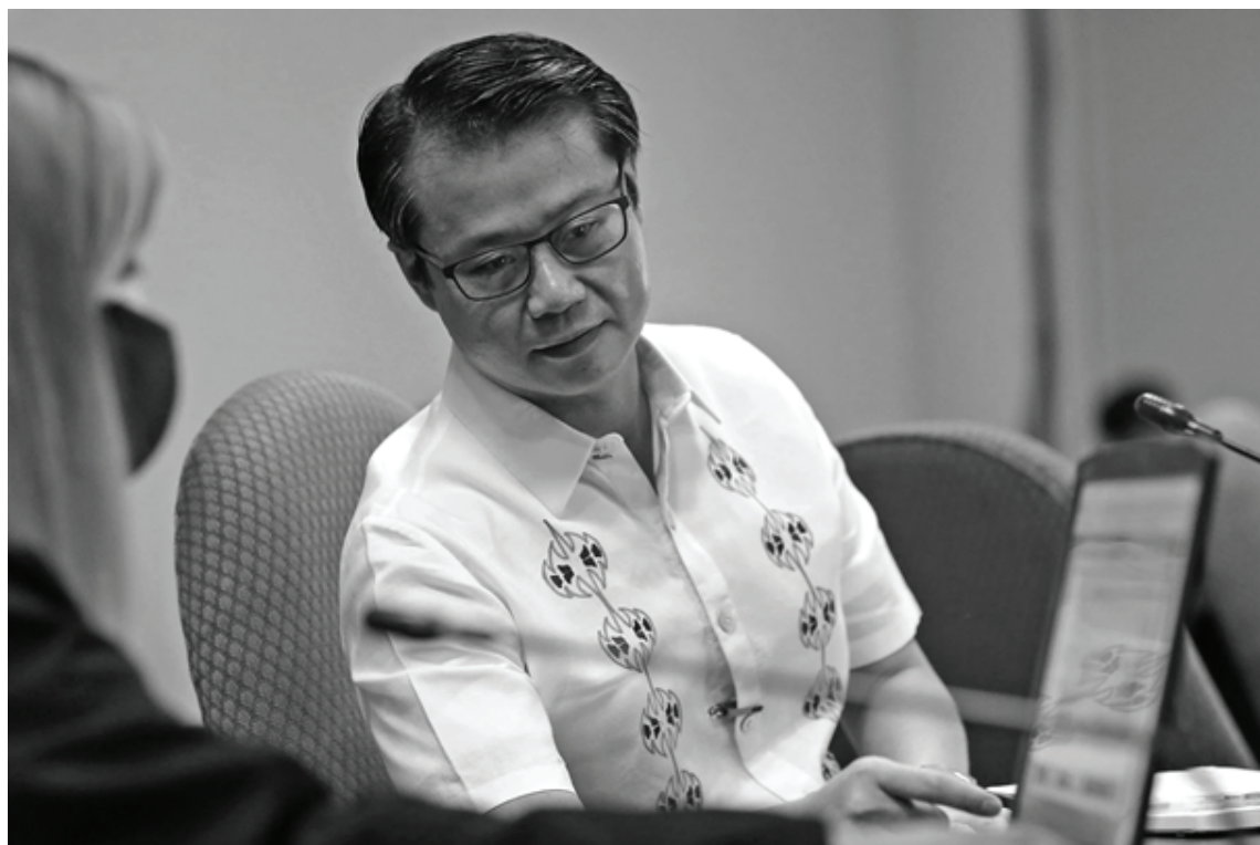
Senator Win Gatchalian