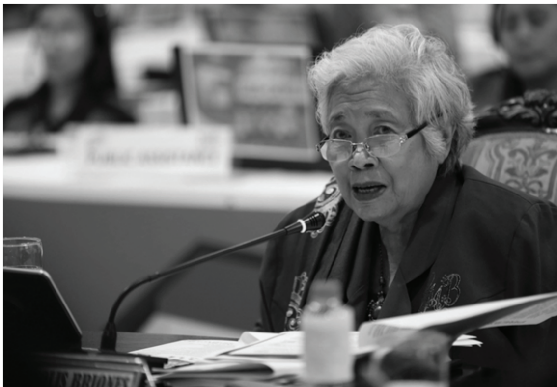
DepEd Secretary Leonor Magtolis Briones led the press conference as part of the launch of the 2019 Oplan Balik Eskwela.