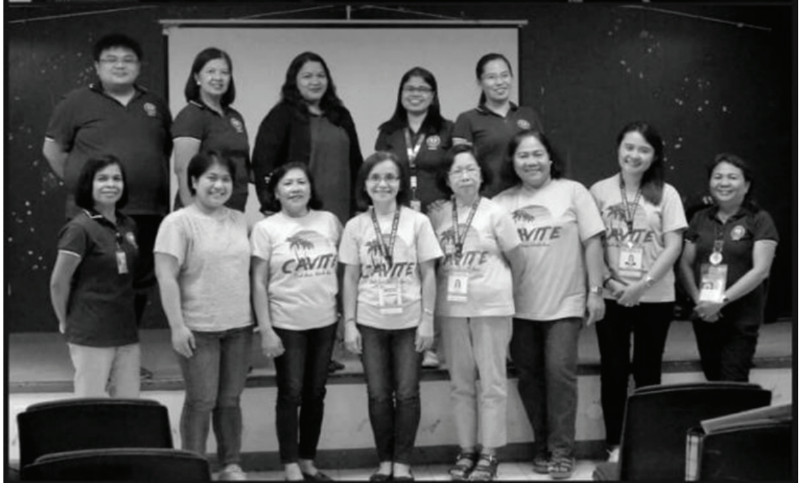
PIA (FILE PHOTO)