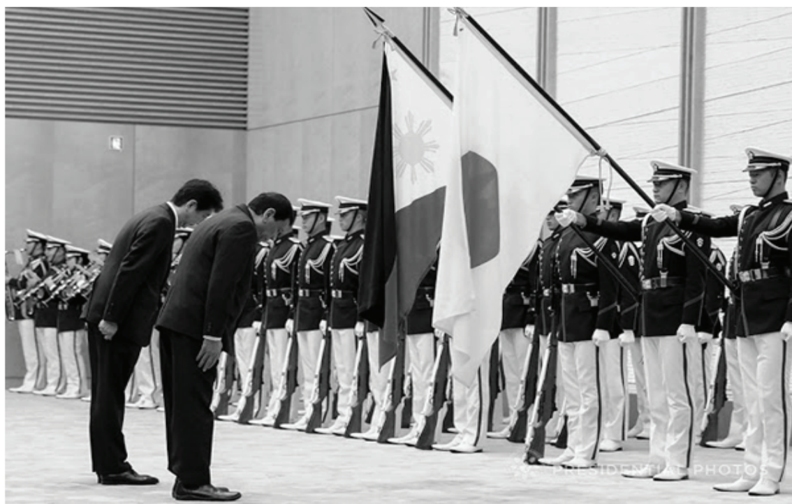
President Duterte's visit to Japan in October 2017.