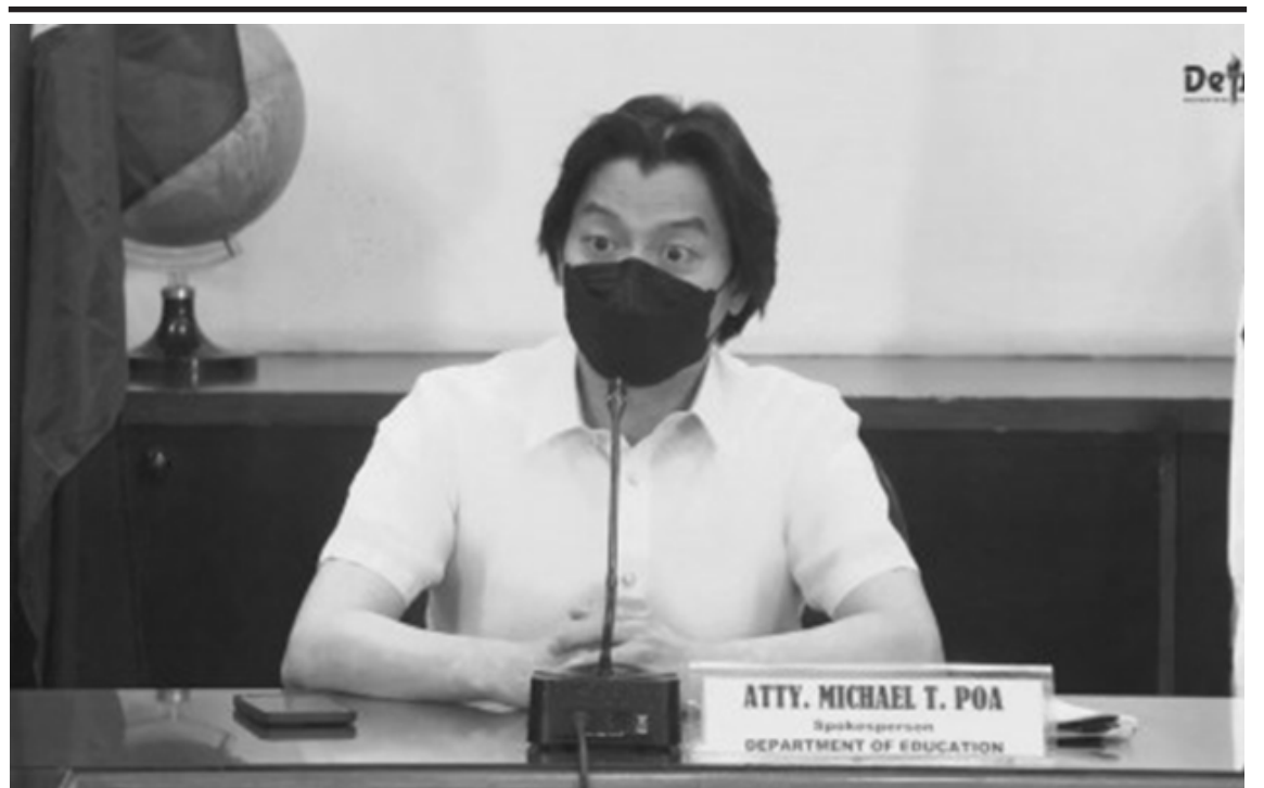
FULL IN-PERSON CLASSES. Education spokesperson Michael Poa gives updates on full face-to-face classes on Monday (Nov. 7, 2022). The majority of public schools nationwide have already implemented full in-person classes. (Screengrab)

Maaari ring magtanong sa inyong barangay health workers tungkol sa kahalagahan ng pagbabakuna sa mga bata. (DOH MMCHD/PIA-NCR)