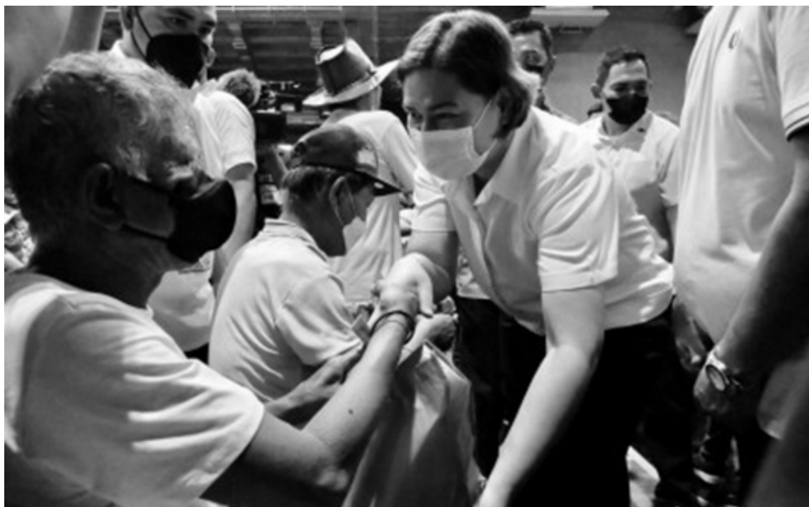
AID TO CAVITE. Vice President Sara Duterte hands over a food pack to a resident in Cavite on Sunday (Nov. 6, 2022). The Office of the Vice President and the local government of Cavite have distributed relief goods to over 5,000 residents in the province.

He hopes that things will normalize for his town in a