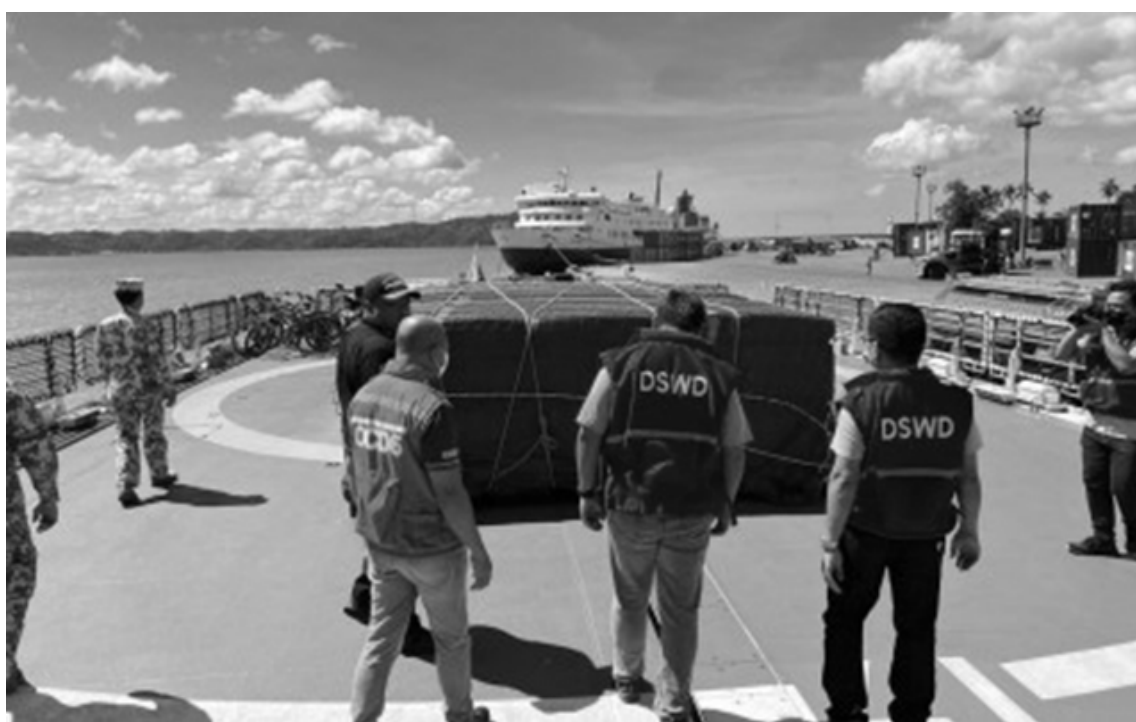
HELP. Some 10,000 family food packs and bottled water from the Department of Social Welfare and Development central office arrive at the Philippine Ports Authority in Fort San Pedro, Iloilo City on board the BRP Melchora Aquino of the Philippine Coast Guard on Saturday (Nov. 5, 2022). The food packs will be distributed to municipalities in the northern part of Iloilo province that were affected by Severe Tropical Storm Paeng a week ago.