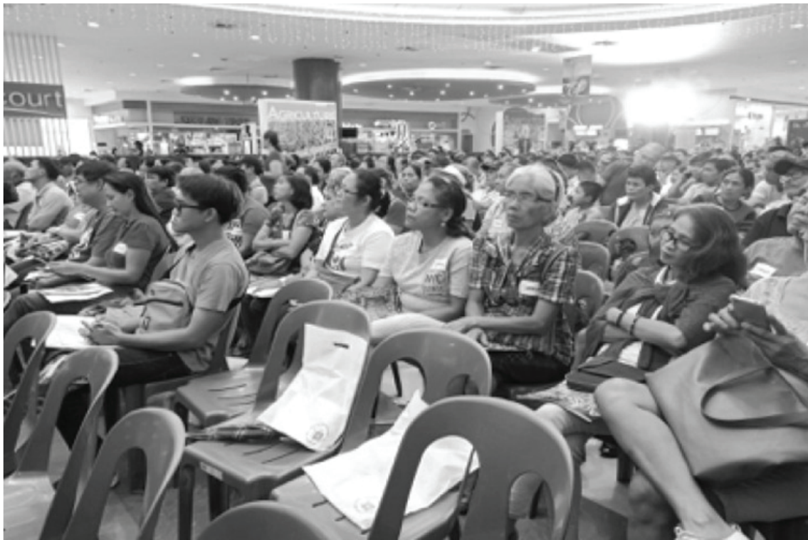
Agri Talk 2019: Urban Agriculture Promotion: Participants eagerly listen and learn from lectures and demonstrations presented by experts on Beekeeping, Square Foot Gardening and Mushroom Production and Processing.