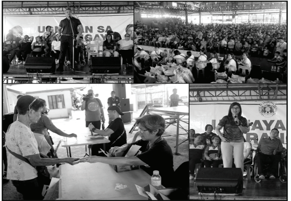
About 289 families who lost their homes due to fire outbreak were gathered at Brgy. Talaba VII Covered Court for the distribution of calamity assistance while 3000 residents flocked at Brgy. Panapaan V Covered Court to participate in another session of Ugnayan sa Barangay on October 29, 2019 in the City of Bacoor. The program aims to hear out concerns of constituents in order to address their basic needs and assess their situations. The events were spearheaded by Governor Jonvic Remulla together with Mayor Lani Revilla and other local officials who delivered words of inspiration assuring them of the provincial government’s support and offering solutions that might ease their burden. Partakers also received pack of rice in exchange of plastic bottles as part of the environmental and ecological projects being implemented by the local and the provincial government.

On the other hand, the committee members expressed their commitment to uphold their role in the fight against VAWC, human trafficking and child pornography for a safer, peaceful community for all. (Ruel Francisco, PIA-Cavite/with reports from PICAD)