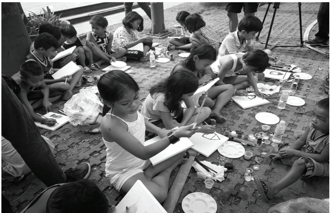
The Department of Social Welfare and Development (DSWD), in partnership with the Department of Health (DOH), Manila Police District (MPD), Manila Health Department, and the City Government of Manila, gathered street children from this city to teach them some art skills through painting. (*FILE PHOTO)

the public to provide responsible types of assistance such as conducting organized gift-giving and caroling activities, feeding sessions, story-telling, and medical missions at the activity centers in the local government units (LGUs) to keep street dwellers and IP groups away continue to page 2