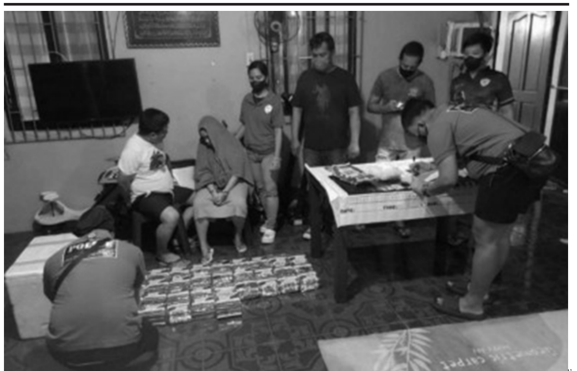
(Nov. 12, 2022). Two suspects were arrested and will face charges.