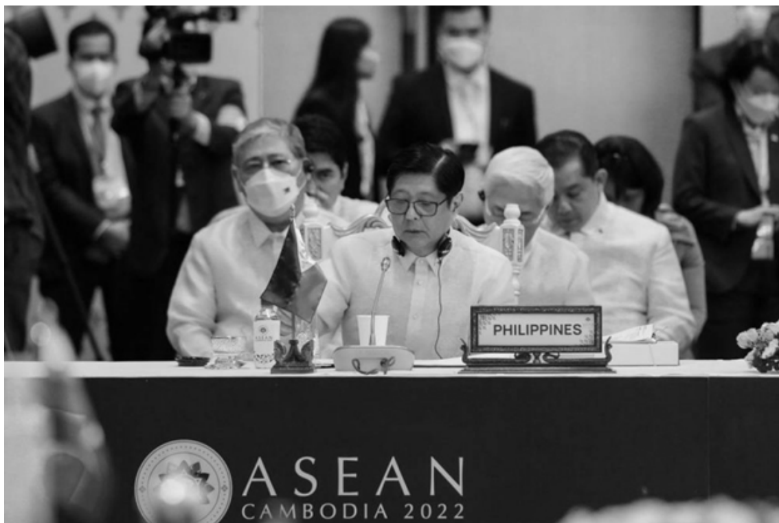
President Ferdinand "Bongbong" Marcos attends 40th and 41st ASEAN and Related Summits in Cambodia