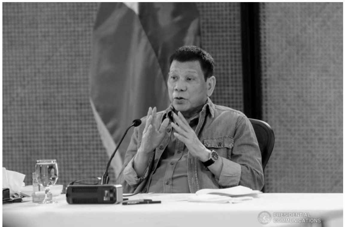
PRESIDENT RODRIGO ROA DUTERTE