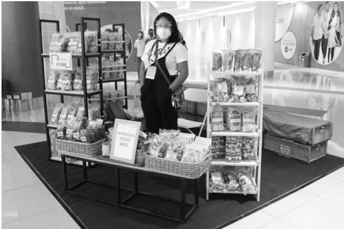
DTI'S BAGSAKAN SPECIAL PROJECT SUPPORTS LOCAL MSMEs