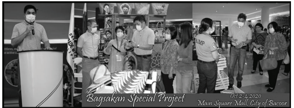
The BIG BAGSAKAN SALE starts today at Main Square Bacoor

"Thanks to the cooperation of all sectors,