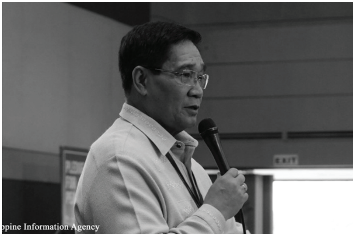
Opine Information Agency