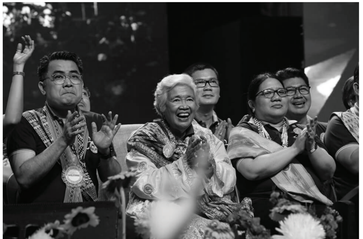
Education Secretary Leonor Briones (center) and other DepEd officials lead World Teachers Day celebration.

Apart from the government-mandated compensation and benefit for all employees (which amount to a total of P27,996 per month for entry-level teachers), public school teachers receive allowance accorded only to DepEd teachers: continue to page 2