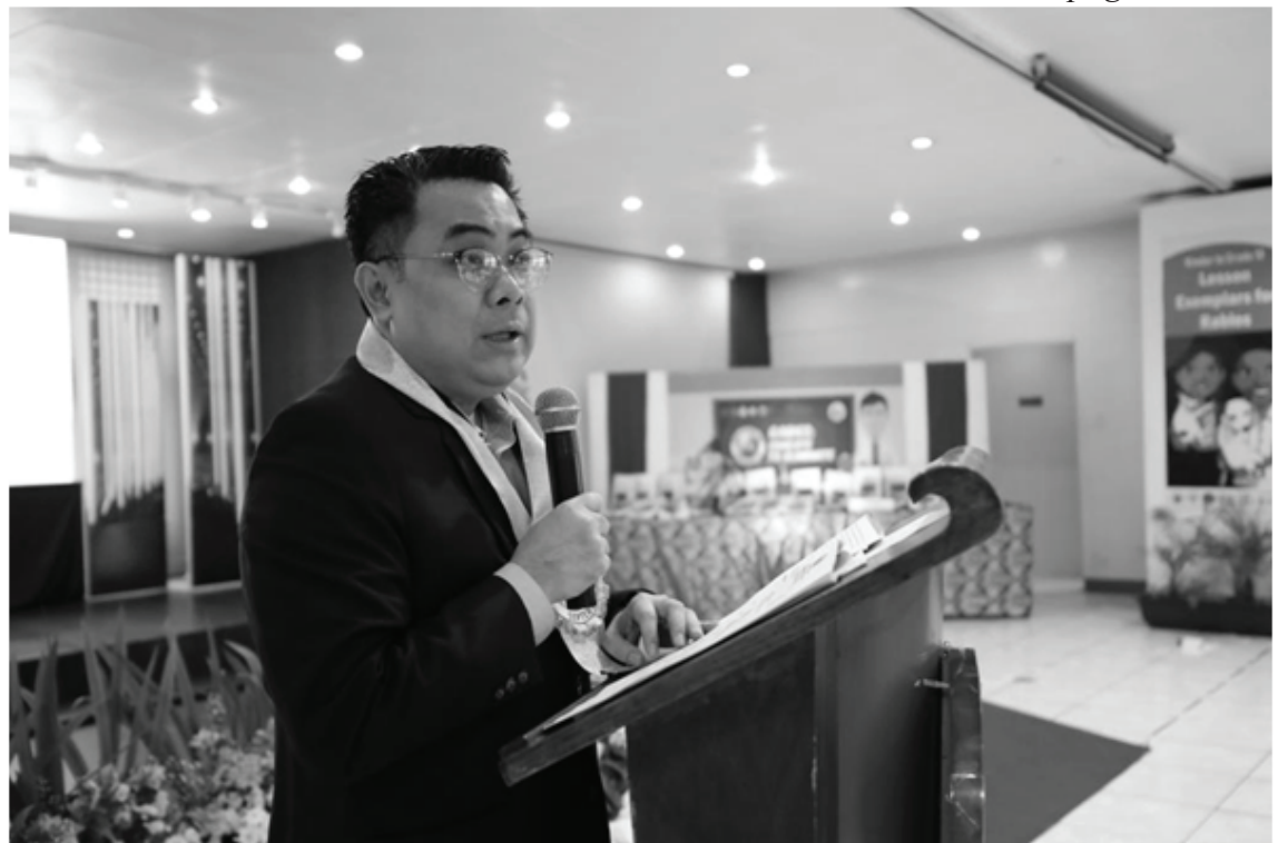
The Department of Education (DepEd) and its partner agencies, the Department of Agriculture (DA) and the Department of Health (DOH), convenes to raise rabies awareness and prevention at DepEd Bulwagan ng Karunungan, Pasig City on September 28.

He further emphasized that education programs about rabies and animal welfare can improve the awareness on rabies and contribute to the reduction of continue to page 2