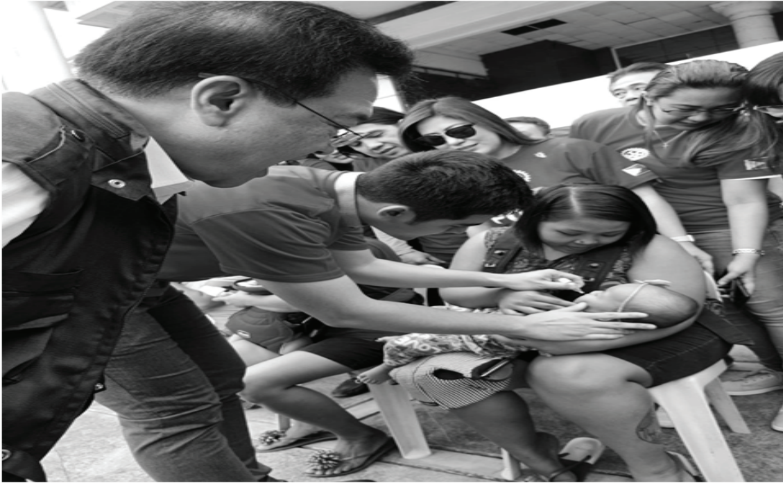
Pasig City Mayor Vico Sotto, on Monday, administers polio vaccine to a child under the supervision of DOH Usec. Mario Villaverde.