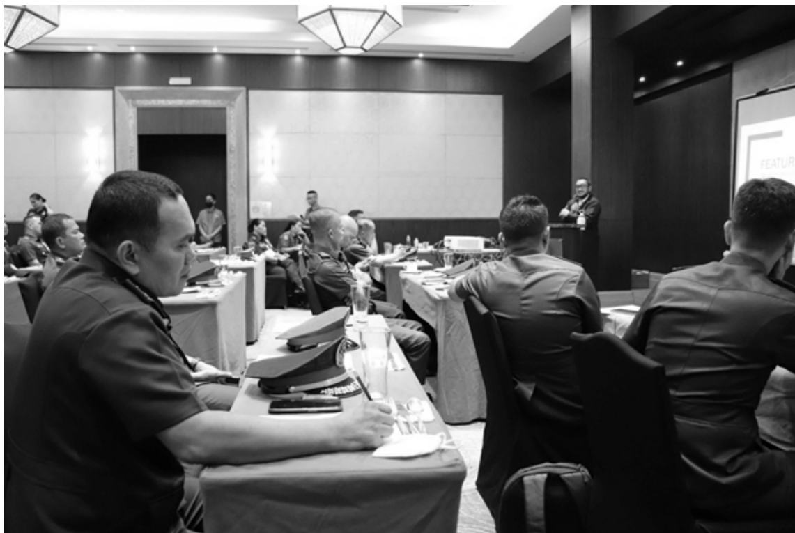
PIA CAVITE (File photo)