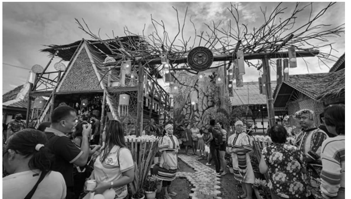
Mabulokon ang pag-abli sa 43rd Lanzones Festival sa Camiguin pinaagi sa pagpahigayon og parada, Music and Kabog Showdown, Lanzones 'eat all you can,' ug Colors of Camiguin in Circus, Oktubre 23, 2022. (RTP/PIA-10/Camiguin)

Ipahigayon usab ang Lanzones Festival Street Dancing karong Sabado ug mahuman ang kasaulogan karong October 30.