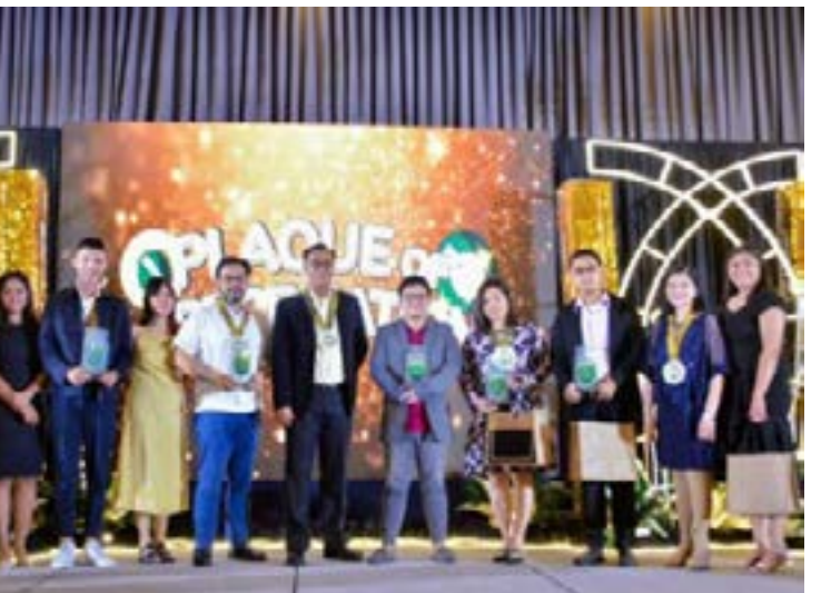
GOOD JAB. The Department of Health's Center for Health Development (DOH-CHD) in Calabarzon on Friday (Sept. 29, 2023) awarded employees and partners who contributed to the success of the Chikiting Ligtas supplemental immunization activity. Over one million children from newborn to five years old received their jabs in the five-province region.

"There are still a small number of parents who are hesitant about having their kids vaccinated... that is why we have dispatched our health promoters and advocacy units to talk to the mothers and explain the importance of getting jabs. We point out to them how only a handful of people are afflicted with polio nowadays. This proves that the immunization program over the years has worked," she said in Filipino. (PNA)