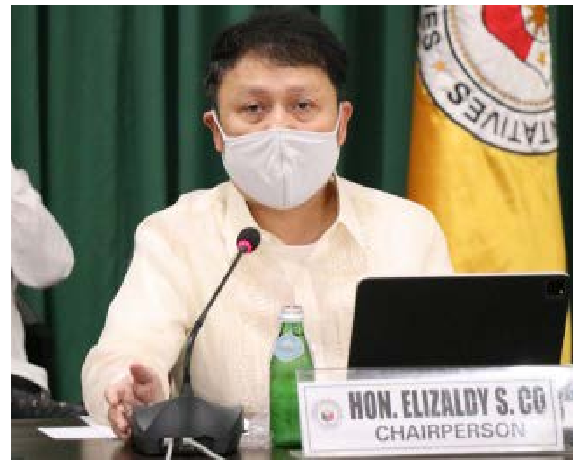
House Appropriations Committee chairperson Elizaldy Co

"As a result, the House was able to assess and evaluate the nature and use of these funds and correct any mix-ups and allay public concerns regarding this issue," he said. (PNA)