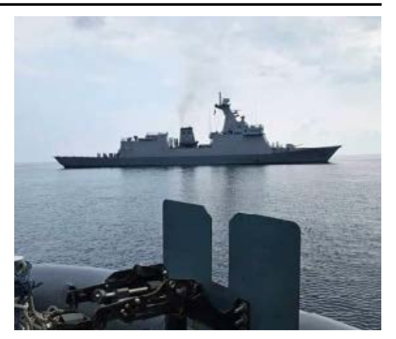
BOOSTING\ THE\ FLEET.\ The\ Philippine\ Navy's\ missile\ frigate\ BRP\ Antonio\ Luna\ while patrolling the West Philippine Sea on Sept. 22, 2023. The BRP Antonio Luna is one of the two Jose Rizal-class frigates that will be backed up by the two missile corvettes being constructed by HHI.

These ships will backstop the two Navy's Jose Rizalclass frigates, also constructed by HHI. (PNA)