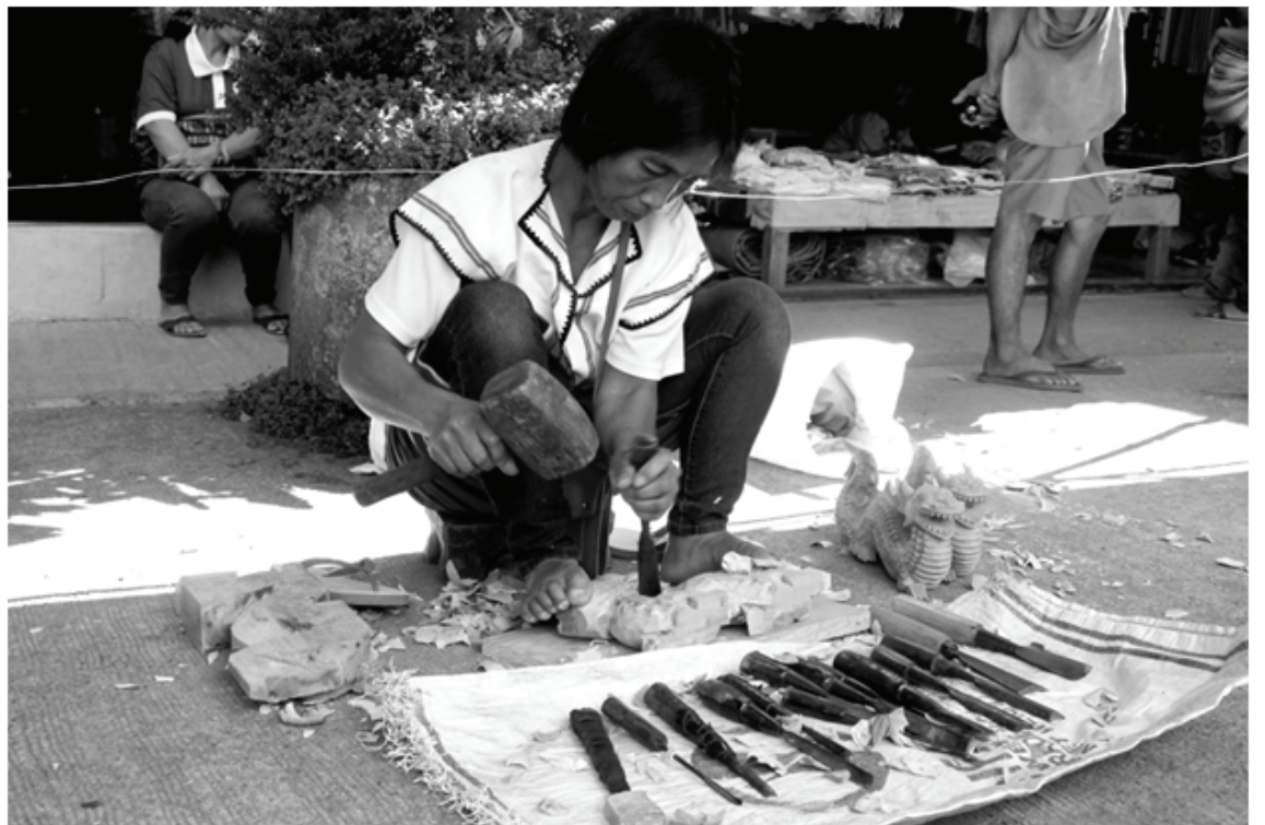
ADDITIONAL INCOME. Along with the boom of the tourism industry in Banaue, woodcarving has become an additional income generating activity for most families.