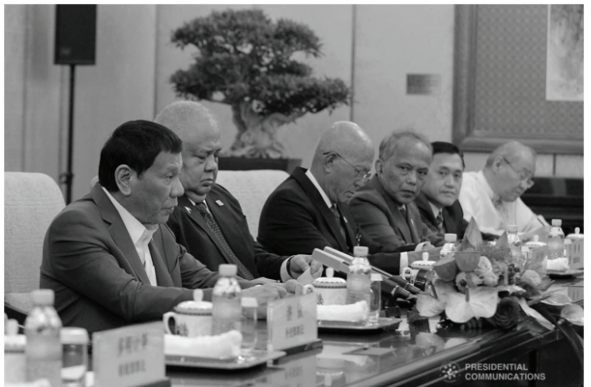
President Rodrigo Roa Duterte and People's Republic of China President Xi Jinping discuss matters during the bilateral meeting at the Diaoyutai State Guesthouse in Beijing on August 29, 2019.