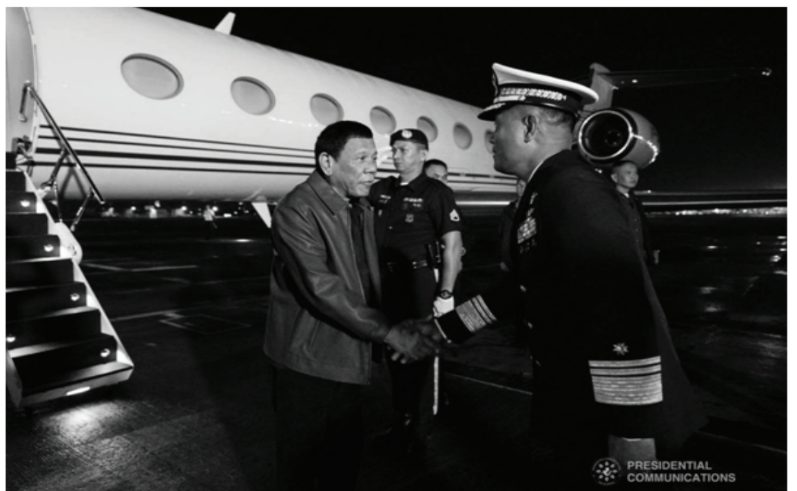
President Rodrigo Roa Duterte is welcomed by a military officer upon his arrival at the Villamor Air Base in Pasay City on September 1, 2019 following his successful official visit to the People's Republic of China.