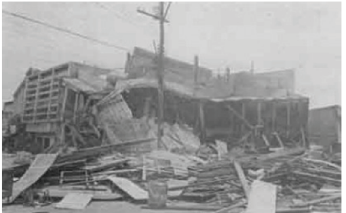
The aftermath of the magnitude 8 earthquake that hit Mindanao on Aug. 1976.

It was back in Manila when I was able to write my story at the PNA editorial office on the 3rd floor of the National Press Club building in Intramuros. The August 17, 1976 earthquake-tsunami hogged the headlines not only in the country but all over the world, one of the biggest coverages a journalist will never forget. (PNA)