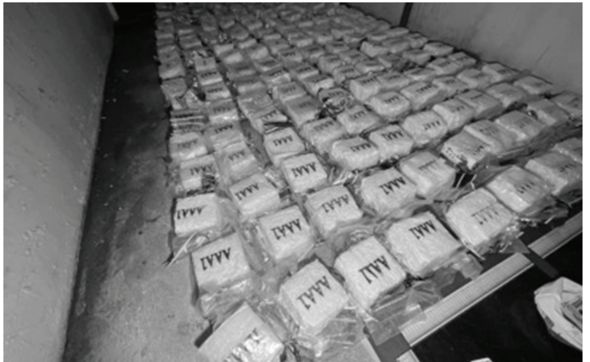
ANOTHER BIG HAUL. The PHP1.5 billion worth of suspected shabu seized by authorities in separate buy-bust operations in the cities of Imus and Bacoor in Cavite on Sept. 9, 2021. The operations came just three days after the confiscation of PHP4 billion worth of suspected shabu in Zambales and Bataan.