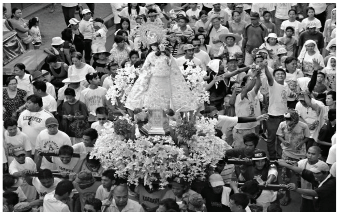
The karakol — a dance procession held on the eve of a feast day of patron saints — is a tradition that is greatly affected by the ongoing virus pandemic.

Malaya also reminded the public — vaccinated or not — to refrain from participating in mass gatherings.