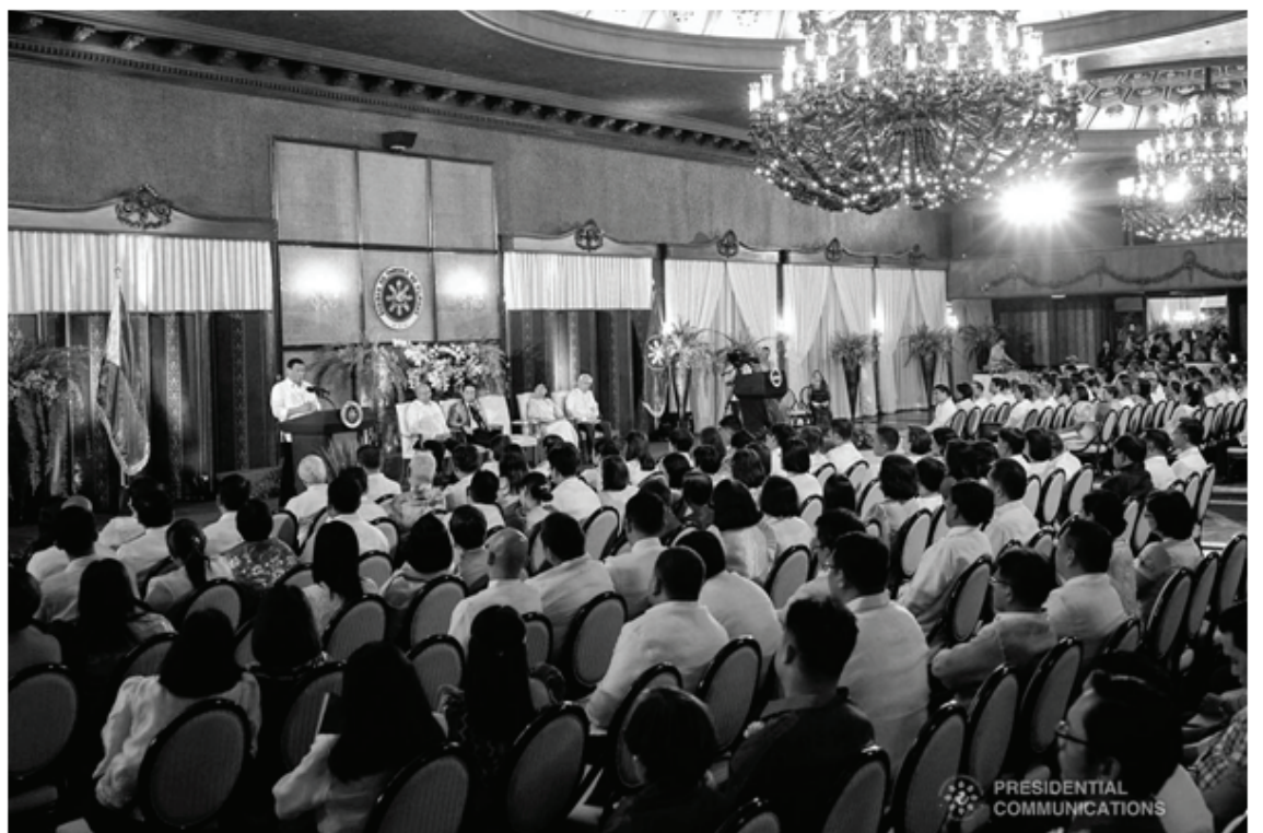
President Rodrigo Roa Duterte delivers his speech during the 2019 Outstanding Government Workers Awards Rites at the Malacañan Palace on September 10, 2019.