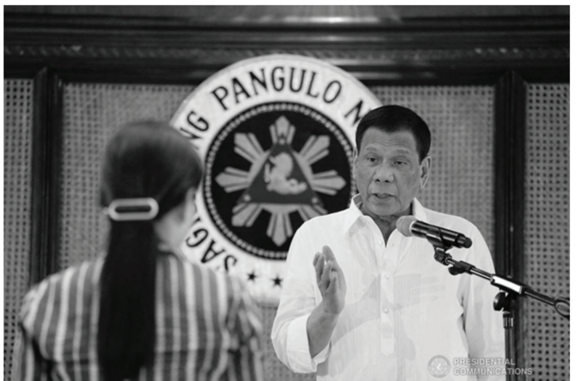
President Rodrigo Roa Duterte answers queries from the members of the media following the oath-taking ceremony of the officers of the Malacañang Press Corps, Presidential Photojournalists Association, and Malacañang Cameramen Association at the Malacañan Palace on September 10, 2019. KING