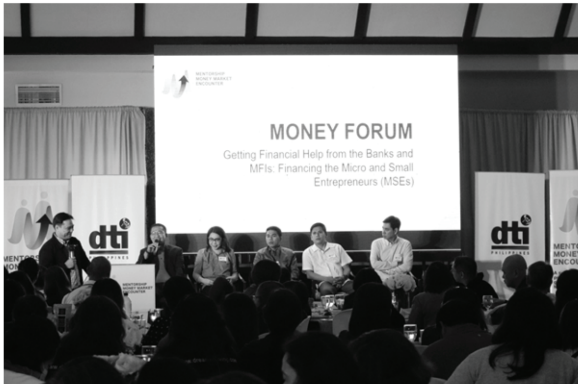
Representatives from banking and lending institutions as they explain various financial schemes and opportunities which could help MSMEs expand their business and enterprises.