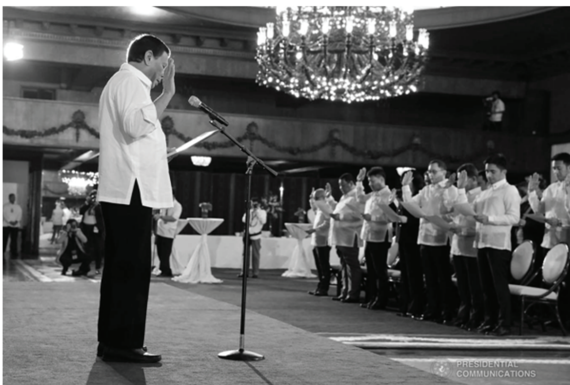
President Rodrigo Roa Duterte administers the oath to the newly appointed officials during a ceremony at the Malacañang Palace on September 17, 2019.

Release of old convicts Meanwhile, President Duterte said he would ask the continue to page 2