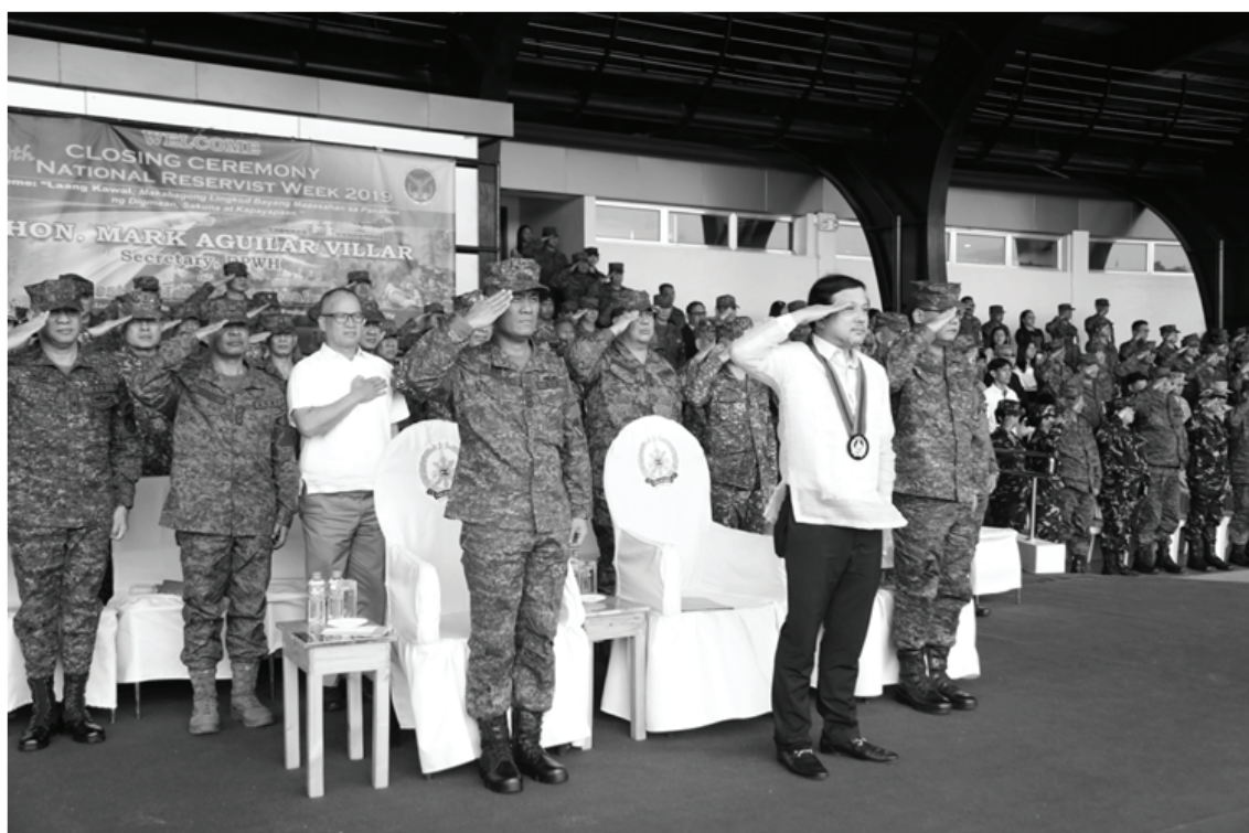
The AFP hosted the closing ceremony of the 40th National Reservists Week on Saturday, September 21 at the Lapu-lapu Grandstand in Camp Aguinaldo, Quezon City. Among the highlights of the ceremony were the awarding of outstanding reservists and reservist units, and the parade of troops and capabilities.

The outstanding reservist units of the year were Naval Forces Reserve-Eastern Visayas, 51st Naval Group Reserve, and Leyte College Reserve Officers Training Corps (ROTC) Unit. Meanwhile, the 704th Reserve Communication Center continue to page 2