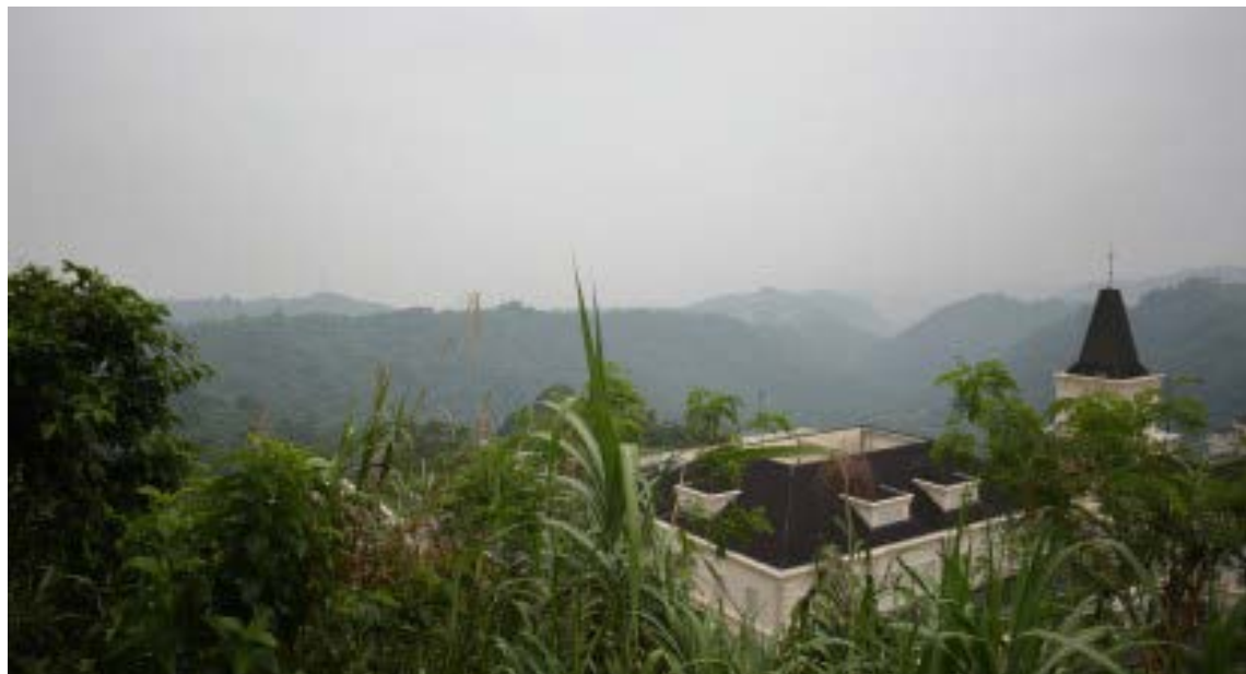
VOG. Low visibility of Taal Lake, as seen from Tagaytay City on Sept. 22, 2023. Taal Volcano emitted high levels of hazardous sulfur dioxide last week, prompting class suspensions in the city and in nearby towns of Batangas province. (PNA photo by Benjamin Pulta)

notably much less dense than in previous days. (PNA)