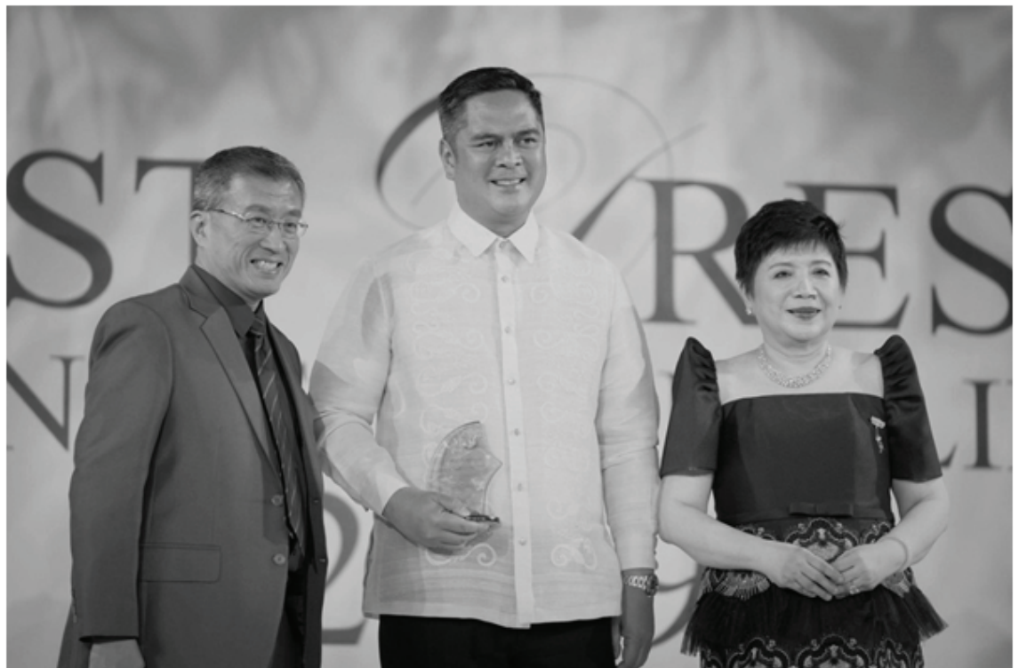
Presidential Communications Secretary Martin M. Andanar receives the "Most Effective Communicator" special award during the Philippine Cancer Society Inc. Best Dressed Women of the Philippines 17th Annual Awards Ball on September 25, 2019, at the Okada Manila in Parañaque City.

programs. "I deeply appreciate the award given to me by the Philippine Cancer Society. But you know this award, the symbol and the importance of this is really what we can do to help cancer patients in our country. The Philippine Cancer Society has been in the advocacy of helping cancer patients especially those patients who cannot afford medicine and continue to page 2