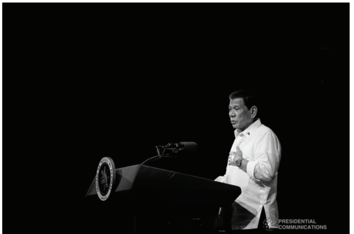
President Rodrigo Roa Duterte delivers his speech during the Golden Topper Corporate Launch at the Aseana Business Park in Parañaque City on September 25, 2019.